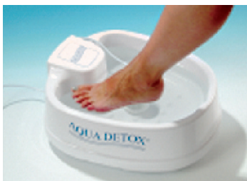
When You Start!