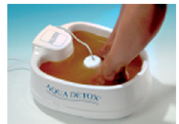
When You Finish!