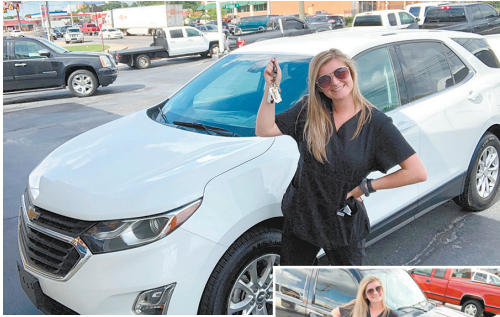
Mackenzie's new Chevy Traverse