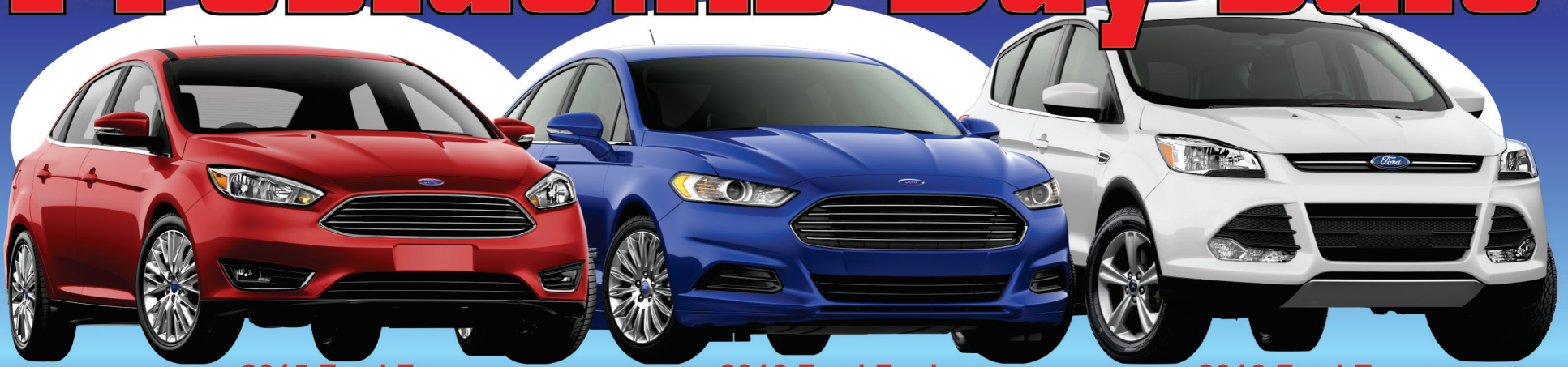
2015 Ford Focus