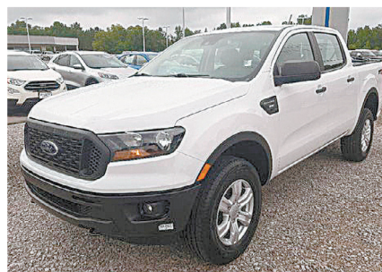
2020 Ford Ranger Stk#A4599N MSRP:$30,280 NOW: $27,900

Service & Parts Open Mon. - Fri. 7:30 A.M. - 5:30 P.M.