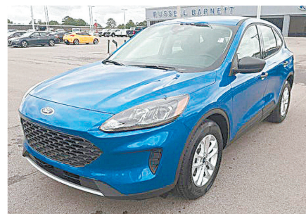
2020 Ford Escape Stk#A4585N MSRP:$26,725 NOW: $21,900