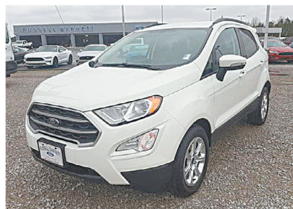
2020 Ford Ecosport Stk#A4518N MSRP:$24,545 NOW: $18,900