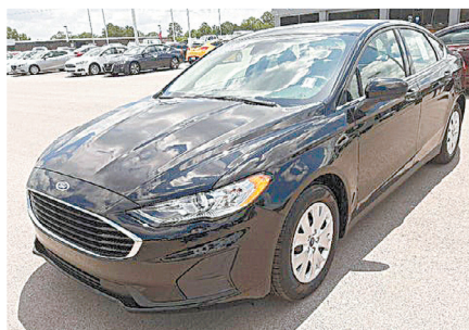
2020 Ford Fusion Stk#A4604N MSRP:$25,655 NOW: $20,900