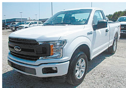
2019 Ford F-150 XL Stk#A4329N MSRP:$32,395 NOW: $23,900