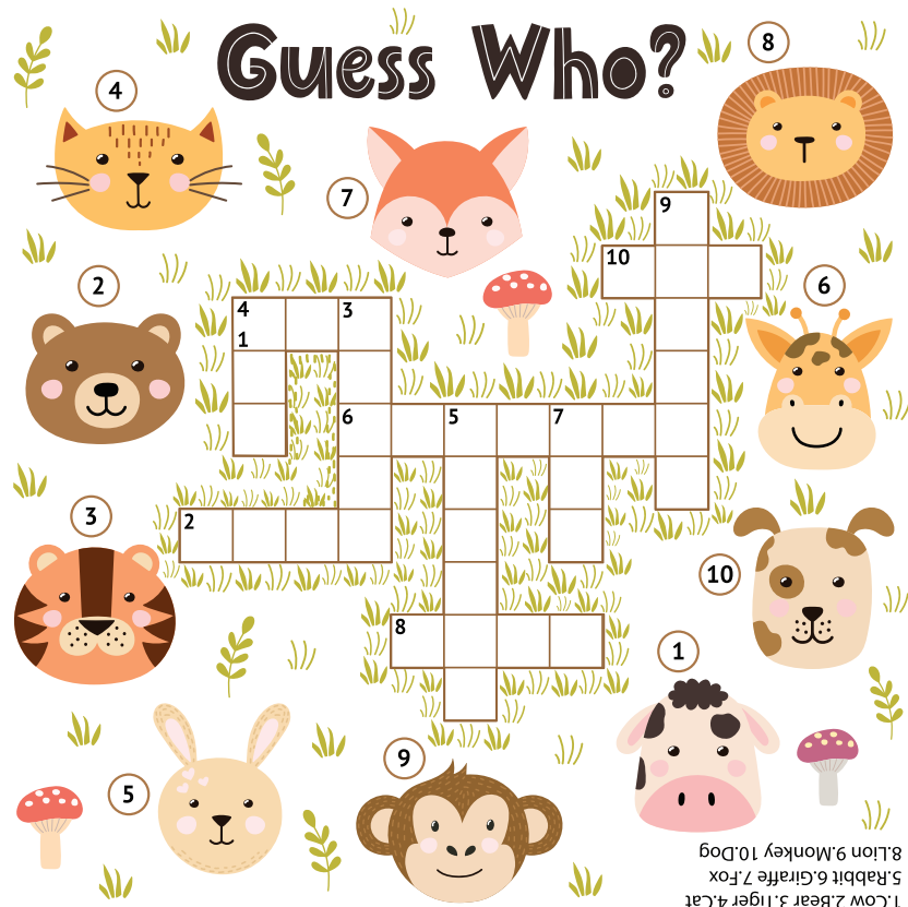
1. Cow 2. Bear 3. Tiger 4. Cat 5. Rabbit 6. Giraffe 7. Fox 8. Lion 9. Monkey 10. Dog

Fill in the names of each animal into the numbered spaces below.