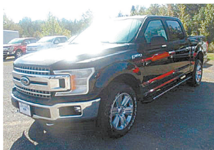
2019 Ford F-150 Stk#A4360N MSRP:$50,980 NOW: $39,900