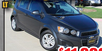
STK# 3216P $11,999