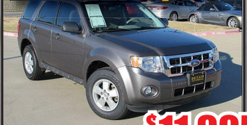
STK# 9004B $11,995