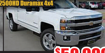
STK# 9015A $50,999