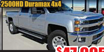
STK# 9069A $47,995