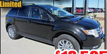
STK# C4326A $13,595