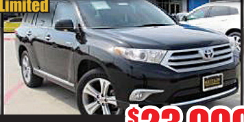
STK# 9008A $23,999