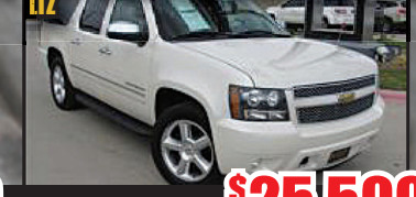
STK# 9089A $25,500