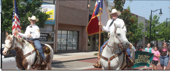
Political ad paid for by the Lewis Tatum for Sheriff campaign.

ELECT LEWIS TATUM SHERIFF OF HOPKINS COUNTY AND I WILL CONTINUE TO SERVE THE CITIZENS AS I HAVE FOR THE PAST 18 YEARS!!!!