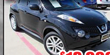
STK# 8961A $13,999