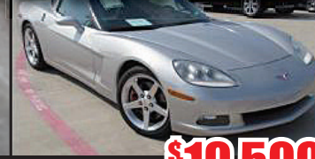
STK# 8995A $19,500