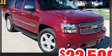
STK# 3208P $22,500