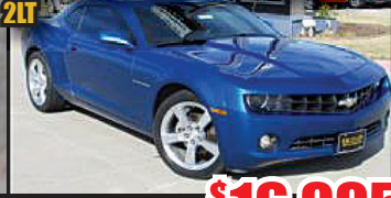
STK# 9153A $16,995