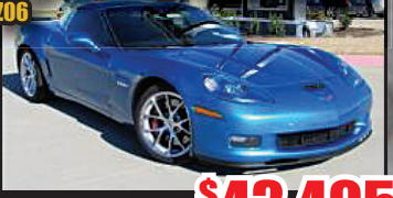
STK# 9155A $43,495