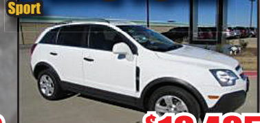
STK# 3223P $16,495