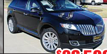
STK# 8803A $26,500