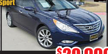
STK# 8880A $20,990