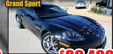
STK# 3225P $39,490