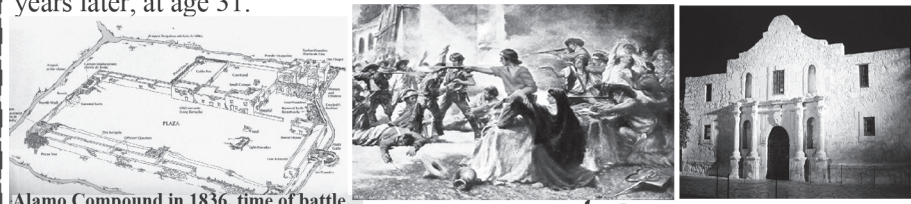
Alamo Compound in 1836, time of battle.