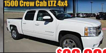
STK# C4299D $26,990