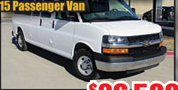
STK# 3199P $26,500