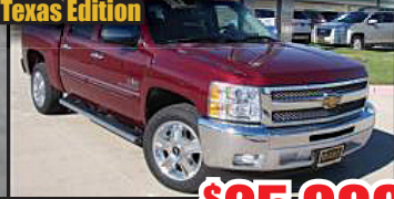
STK# 9032A $25,999