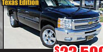
STK# 8485A $23,500