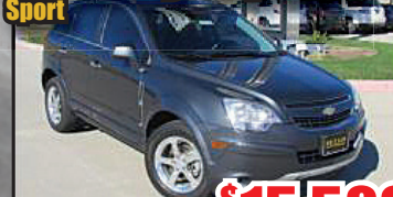
STK# 8607B $15,500