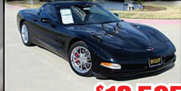
STK# 8747B $13,595