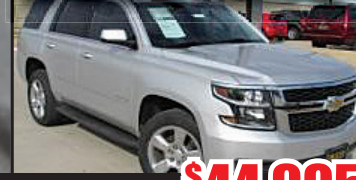
STK# C4269A $44,995