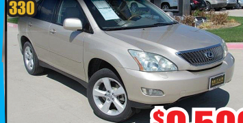
STK# 3165Q $9,500