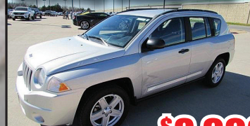
STK# 8798AA $8,990