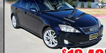
STK# 8616B $13,495