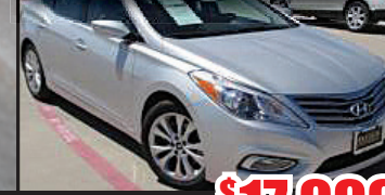
STK# 8744A $17,999