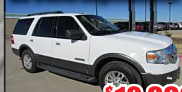
STK# C4313B $10,990