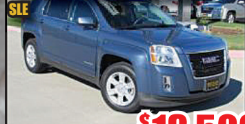
STK# 9009A $13,500