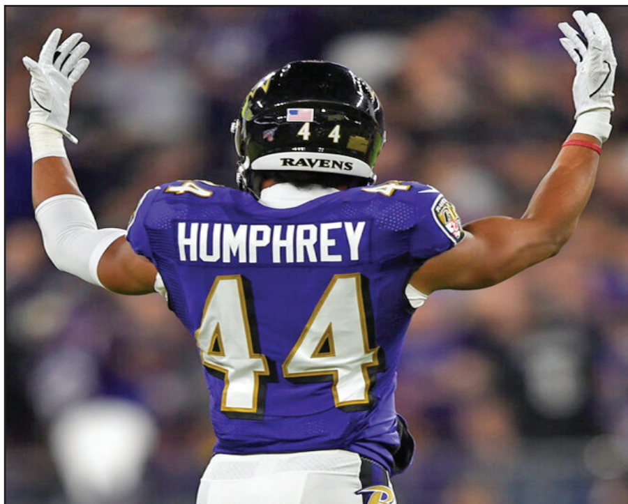
Baltimore Ravens cornerback Marlon Humphrey is from a family of athletes. He took advantage of his family situation during the off-season to workout with his siblings.

"It was really fun. I was back with all five of my brothers and sisters. We did a lot of family workouts, jungle gym, a lot of pushups, pull-ups. I tried to get as much different work as I could. My sister runs track at LSU so I got on the track and did some track workouts. I did a little bit of everything and tried to do