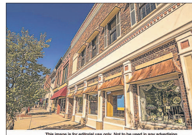
This image is for editorial use only. Not to be used in any advertising.

Promote entrepreneurship Small businesses are