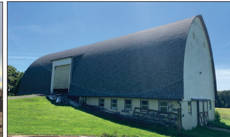
After Roof with Lifetime Scotchgard Algae Protection