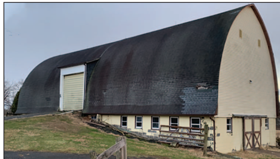
Before Roof with Black Algae Stain