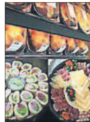
Pictured Top: our store made entrées

Our hours of operation are Sunday's 8 a.m.-8 p.m. and Monday - Saturday 7 a.m.-9 p.m.