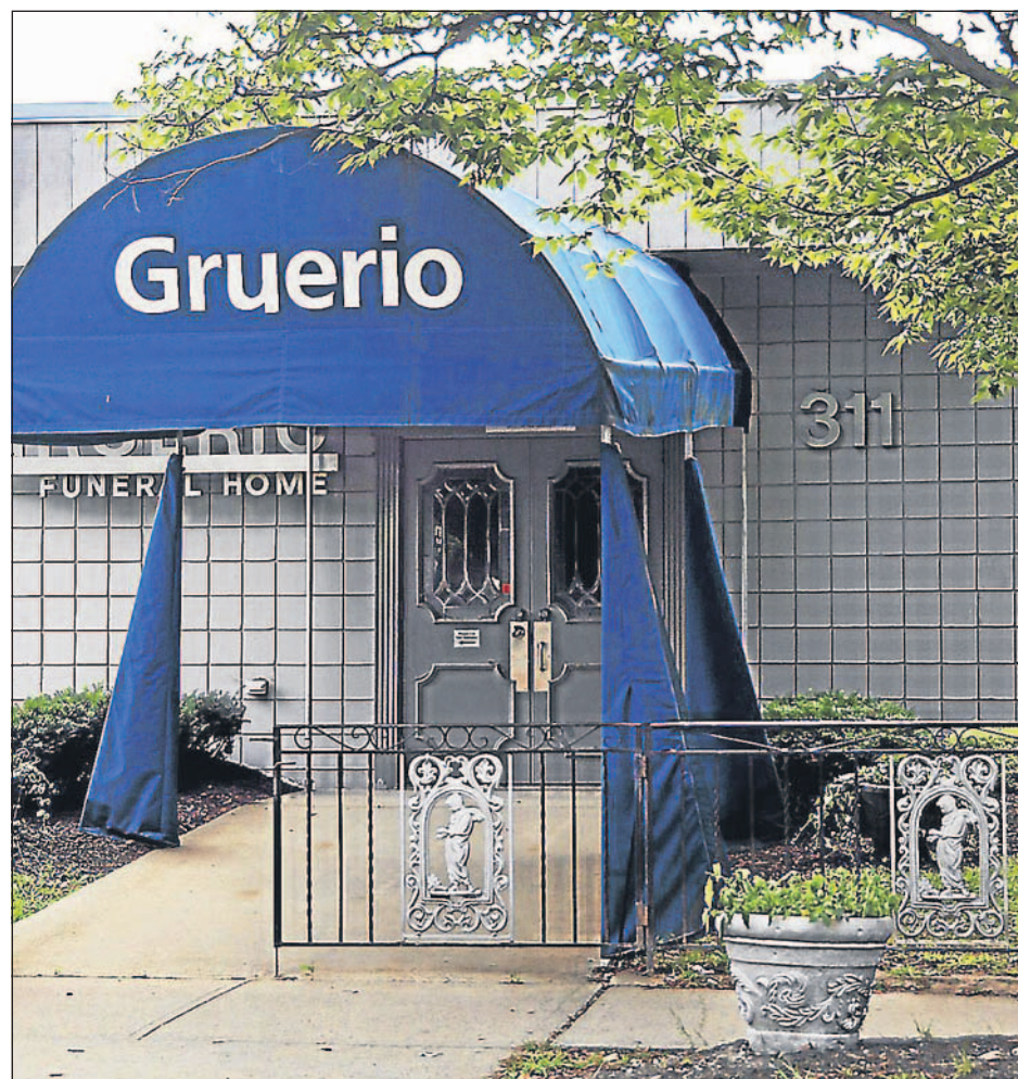
Exterior of Gruerio Funeral Home at 311 Chestnut Avenue in Trenton.