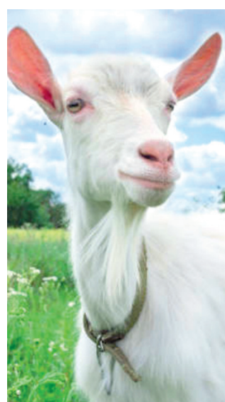
The Crow Wing Soil and Water Conservation District (SWCD) in partnership with the City of Brainerd Parks

Department and the Brainerd Rotary Club, will be utilizing goats to manage invasive species at the Rotary Riverside Park with funds from a MN Conservation Partners Legacy grant. The goats are being contracted through Minnesota Native Landscapes, a native restoration company based out of Otsego, MN.