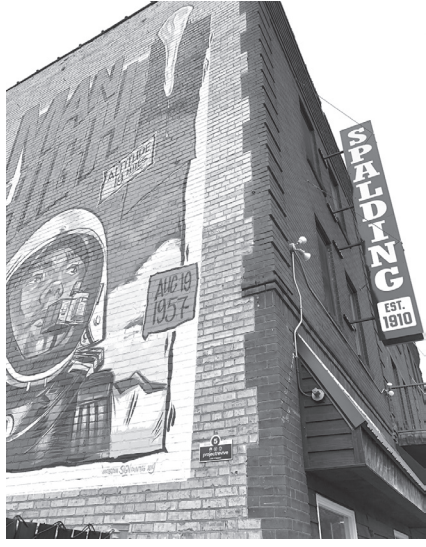
The Range is Rollin' with artistic murals which preserve tradition and history.