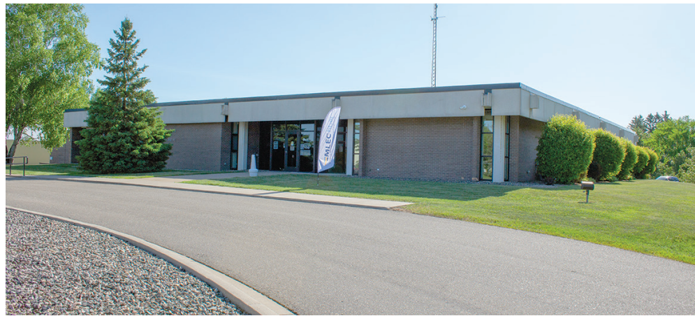
The current building housing Mille Lacs Energy Cooperative on Highway 169/210 east of Aitkin.

Mille Lacs Energy Cooperative (MLEC) in Aitkin is exploring plans for a new building for their headquarters.