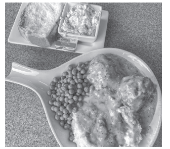
North County Café serves home-style food like their Tuesday Lunch Special Swedish Meatballs.

street, North County Café is expanding into the building next door formerly Crosby Crystal Cleaners. North County Café remain open for breakfast and lunch during the expansion.