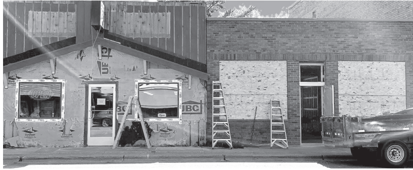
North County Café is expanding into the former Crosby Crystal Cleaners building.

By ANN SCHWARTZ Downtown Crosby has gone through a couple of evolutions in the last 30 years or so. In the early 90s, when mining had left and the area was suffering, it tried to hang onto its traditional downtown — with a five and dime store, department store, two grocery stores and more spaces that mirrored downtowns in small towns all across America in