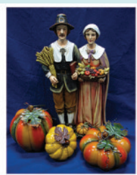
Pumpkins and Pilgrims

Across from the Great Lakes Mall, next to Wendy's