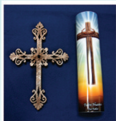
Fretwork Cross and LED Candle