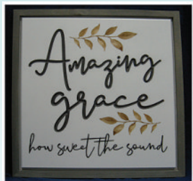
Amazing Grace Wall Art

WE ARE OPEN MONDAY - SATURDAY 10:00 - 8:00 Enjoy shopping throughout our 8,000 sq.ft one-level store