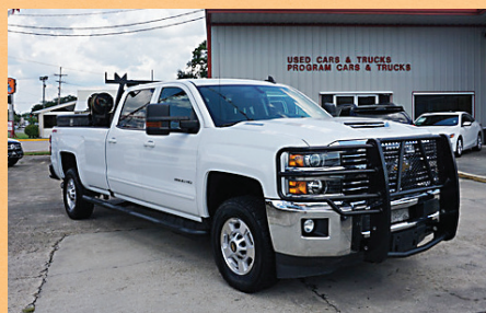
2018 Chevrolet Silverado 2500HD LT #11463..... $39,997