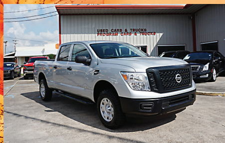
2018 Nissan Titan XD S #11205A.....$28,997