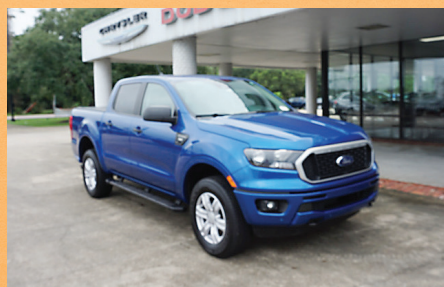
2019 Ford Ranger XLT #T0T024.....$29,997