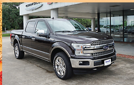
2018 Ford F-150 Lariat #T0J090A.....$49,997