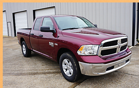
2019 Ram 1500 Classic Tradesman #9T0553.....$27,997