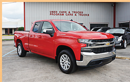
2020 Chevrolet Silverado 1500 LT #11480.....$34,997