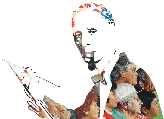
NORMAN ROCKWELL AMERICA'S ILLUSTRATOR