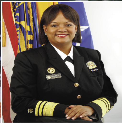
Dr. Regina Benjamin 18th U.S. Surgeon General