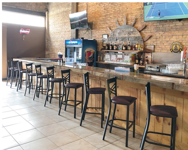
New bar area next to the Skillet in Brainerd has a relaxed and traditional vibe.