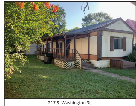
217 S. Washington St.

Sale #1: 410 Campbell Ave. - 2 bed/1 bath home featuring HVAC, nice yard with shade trees. Home has new roof, gutters and water heater installed 2020. Currently rented for $510.00 per month. Long time 8-year renter.