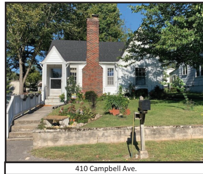
410 Campbell Ave.

ATTN: INVESTORS/ FLIPPERS! Come bid and buy at your price, Thursday evening, on one or both of these fine properties!