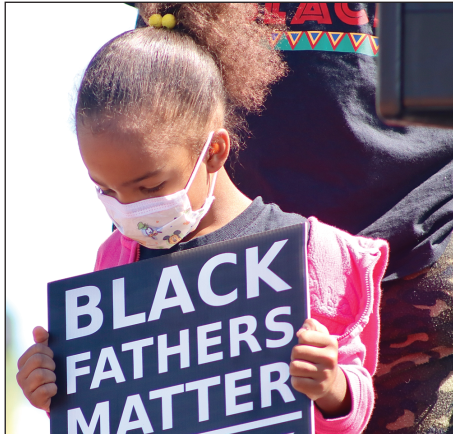
The event drew a crowd of diverse ages, including young children. Over 1,000 people reportedly attended the event.