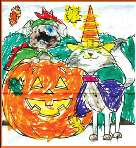
1st Place: Weston Klee PORT CLINTON, PA