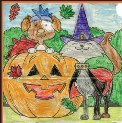
2nd Place: Lacey Bickel HAMBURG, PA