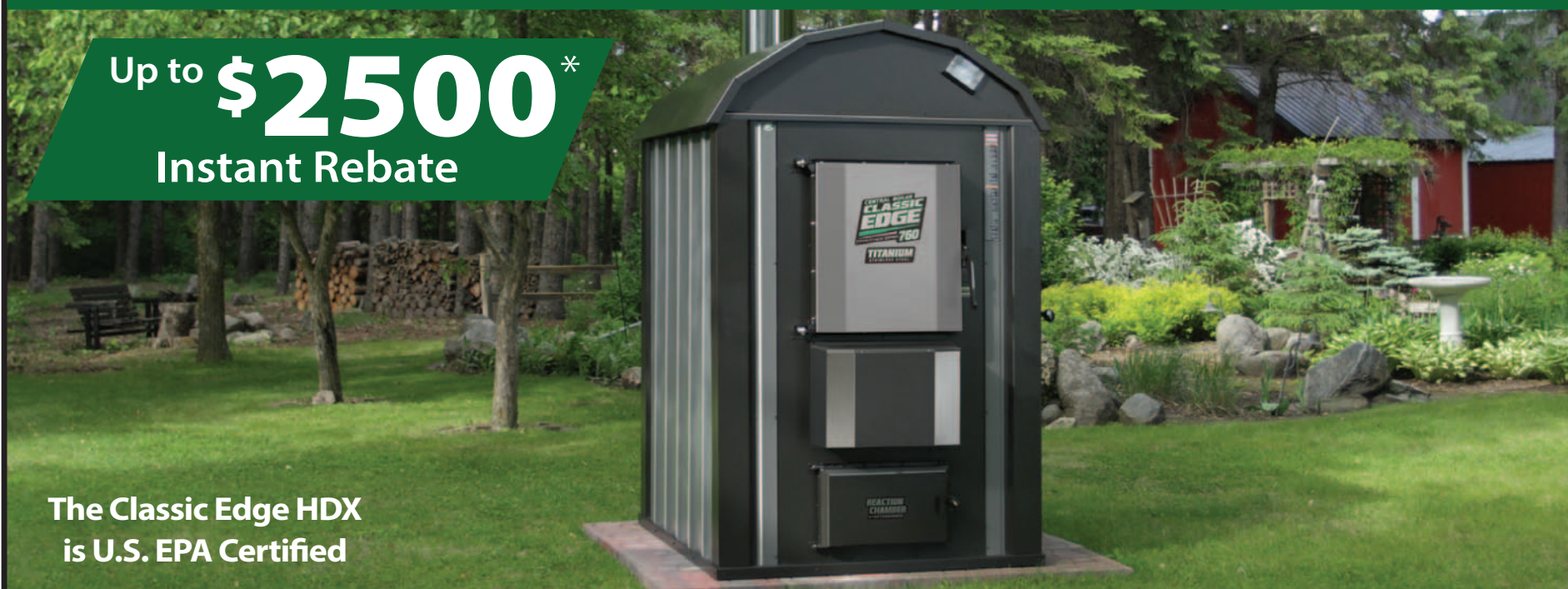
The Classic Edge HDX is U.S. EPA Certified