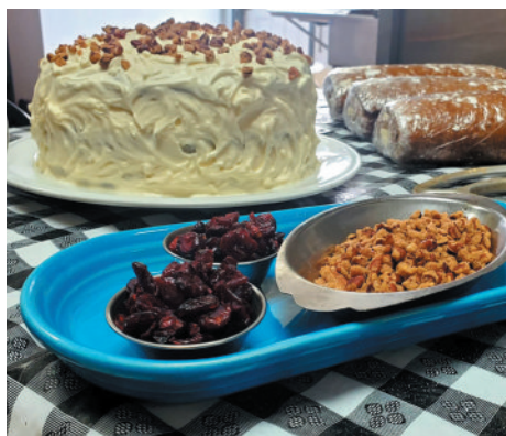
Humming Bird Cake & Pumpkin Rolls

We're open for breakfast, lunch and dinner on Tuesday thru Thursday 7a – 8p. Friday and Saturday 7a – 9p and Sunday 7a – 8p., closed Monday. A very spacious restaurant, with a well-