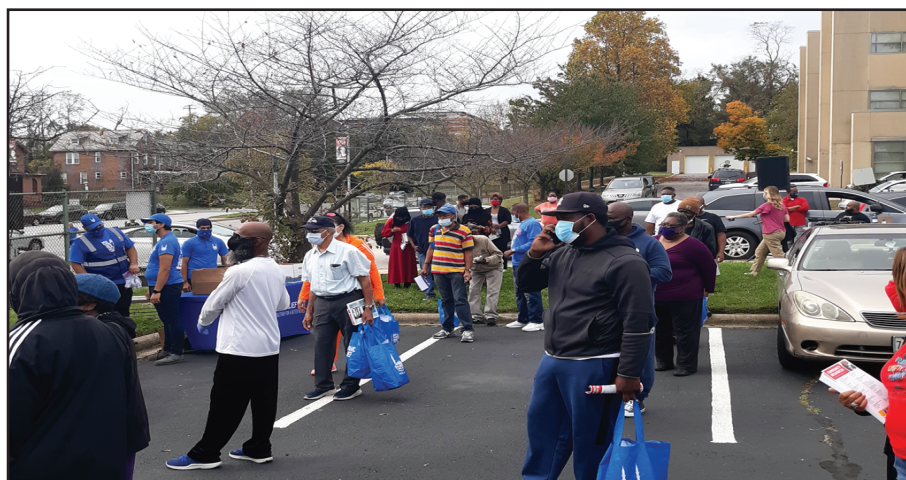
Community members, most of whom were senior citizens, wait in line to receive hot meals at the "All Walks of Faith Summit" at Baltimore City Community College on Oct. 24, 2020.