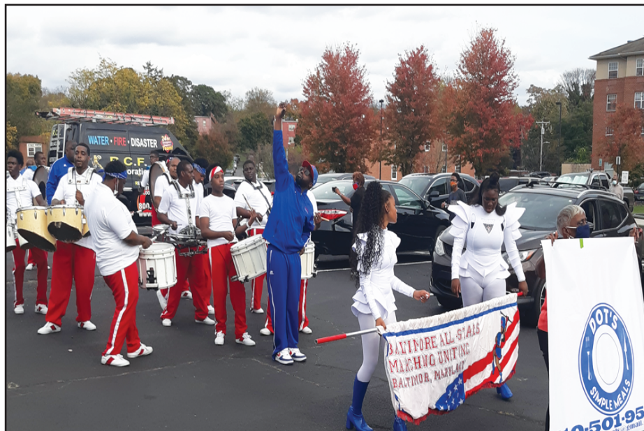
The Baltimore All-Stars Marching Unit delivers an exhibition during the senior feeding summit.