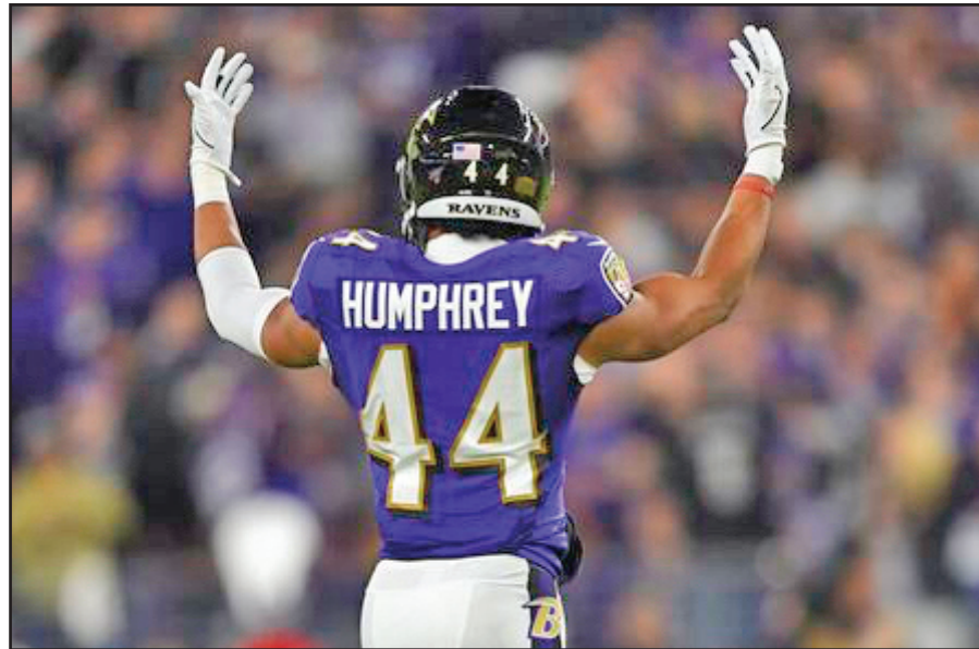
The Ravens placed star cornerback Marlon Humphrey on the COVID-19 reserve list on Monday, November 2 after the game against the Pittsburgh Steelers the day before at M&T Bank Stadium in Baltimore.

"We were informed early this morning that a Ravens player has tested positive for COVID-19. He immediately began to self-quarantine, and our organization is now in the NFL's intensive protocol. In coordination with the league, we have started the process of contact tracing and are following the guidelines of intensive protocol.