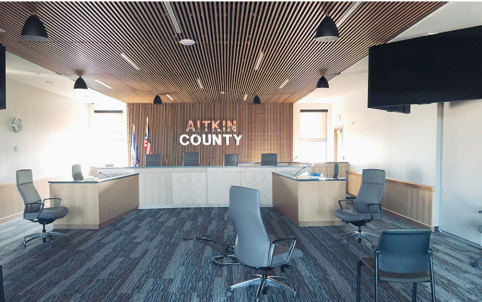
The new Aitkin County Board room is on the third floor of the new Government Services Center Building in Aitkin.