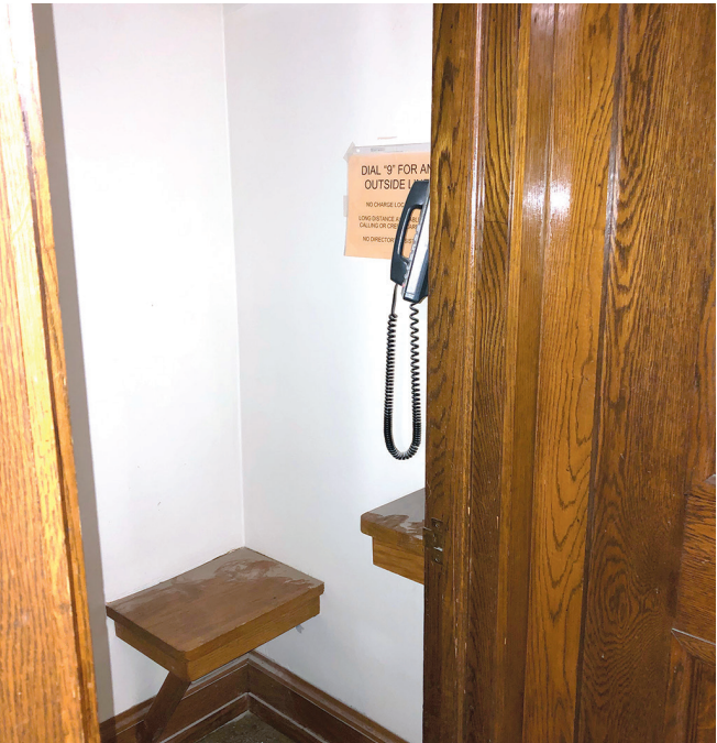
The old wood enclosed telephone booth is still available in the old building.

order to county attorney and court administration work while the top floor contains courtrooms, conference areas and jury rooms -- all updated. The judge in the large courtroom can now see through a window who is approaching