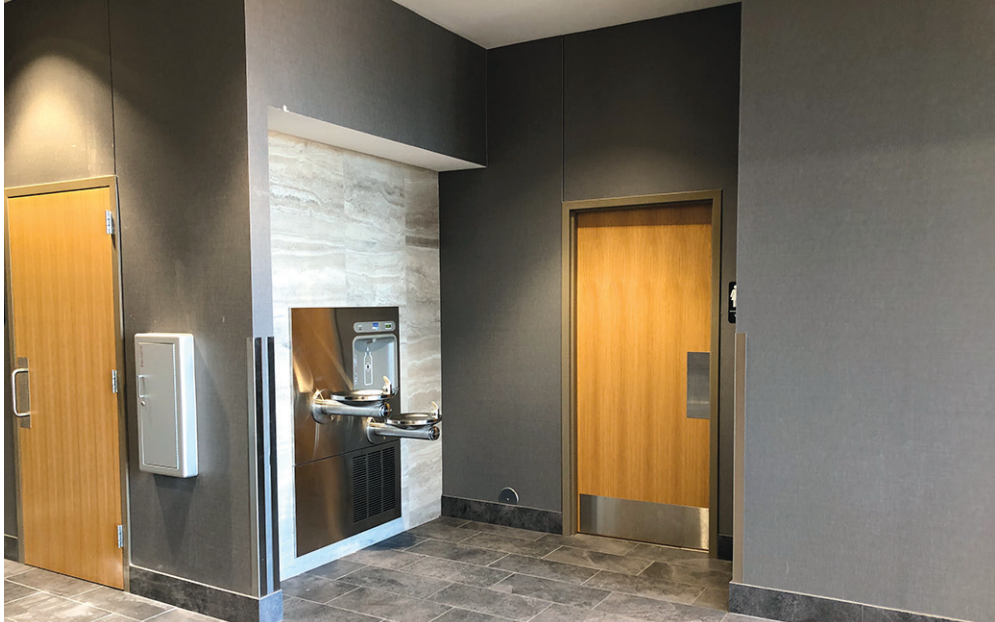
Great new bathrooms and water filling station.