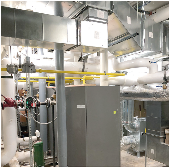
The former assessor's office on the lowest level of the old building is all mechanical machinery now.