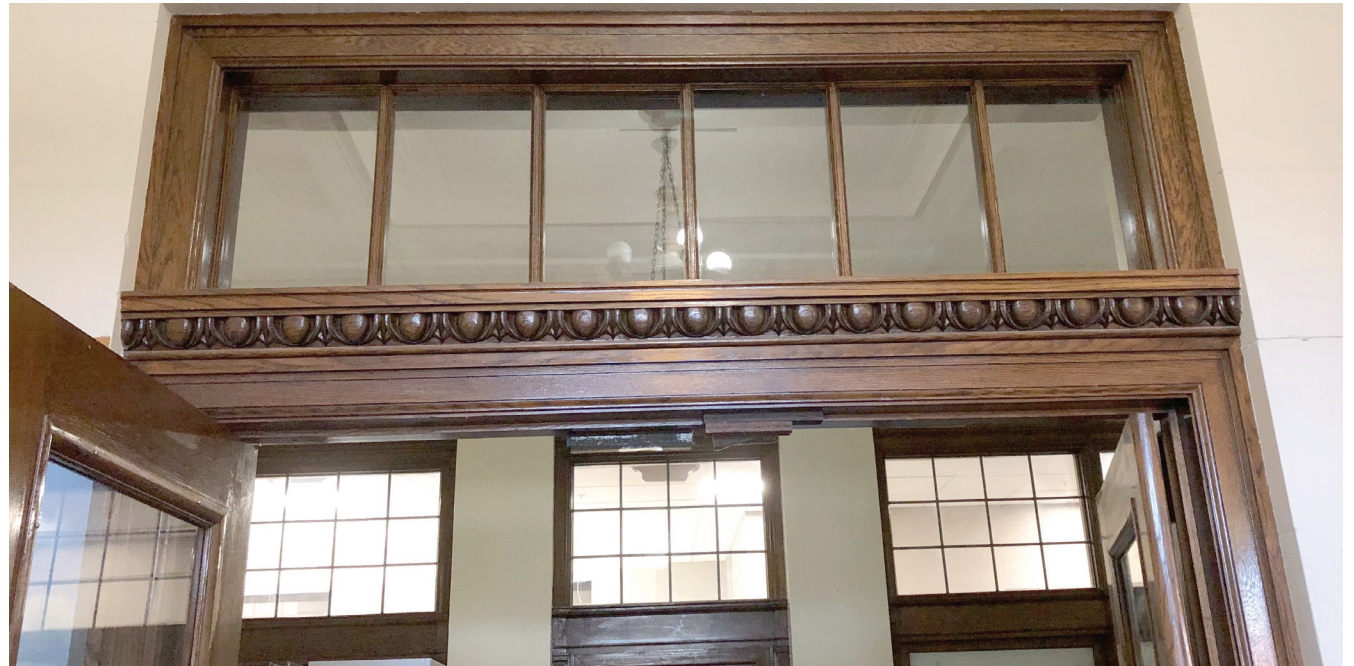
Vintage light fixtures and carved wood still remain in the historic 1929 courthouse.