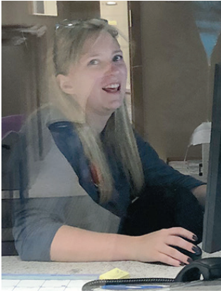
There is an enhanced level of security provided by the sheriff's department.

order to county attorney and court administration work while the top floor contains courtrooms, conference areas and jury rooms -- all updated. The judge in the large courtroom can now see through a window who is approaching