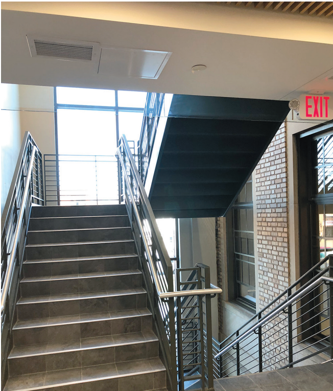
The exterior of the 1929 courthouse can be seen juxtaposed to the new staircase that matches the new building.

the old stone and wood still hold onto the history, beauty and drama of the past.