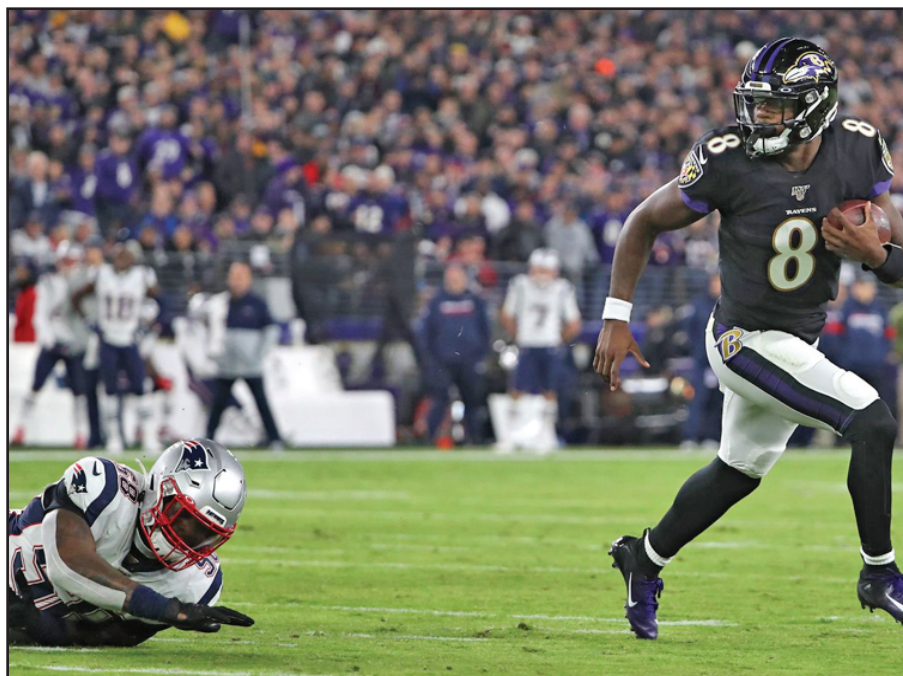
Sunday's game will be the second time that Ravens quarterback Lamar Jackson will face the Patriots. Jackson helped Baltimore upset the undefeated Patriots last season with a 37-20 win.