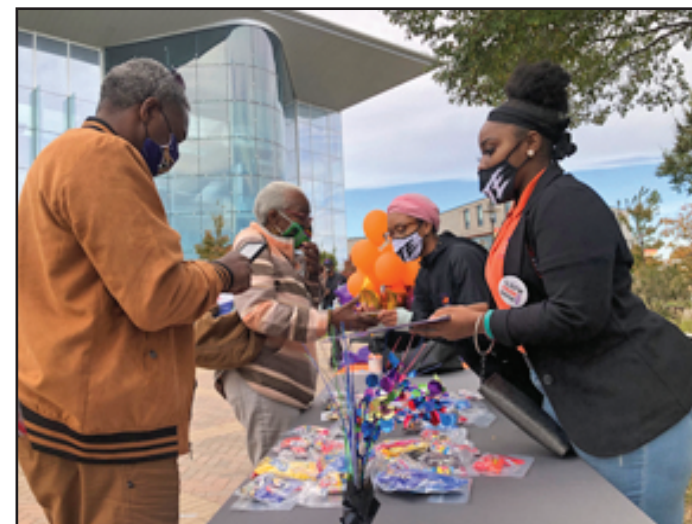
Baltimore Leadership School for Young Women Class of 2021 students greet and help inform Baltimore City voters outside of the Morgan State University polling site on Election Day.