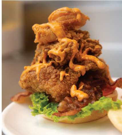
The Seafood Stack – crab cakes, grilled shrimp, lettuce, tomato, bacon, remoulade, and special sauce on toasted bread.

Norton said that while some people are squeamish about eating oysters, her