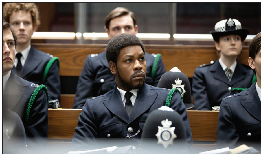
John Boyega as Leroy Logan in "Red, White, and Blue."

Violence broke out, resulting in the arrests of what became known as the Mangrove Nine, including The Mangrove