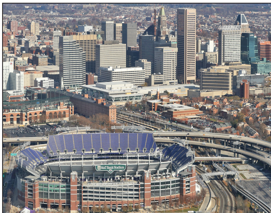
M&T Bank Stadium in Baltimore where the Ravens play their home games. The next home game takes place on Thursday, December 3, 2020 when the Baltimore Ravens host the Dallas Cowboys.

Both Dobbins and Ingram were immediately placed into protocol and missed Thursday's Thanksgiving clash with the Pittsburgh Steelers. Dobbins and Ingram will likely be available for Baltimore's Week 13 game against the