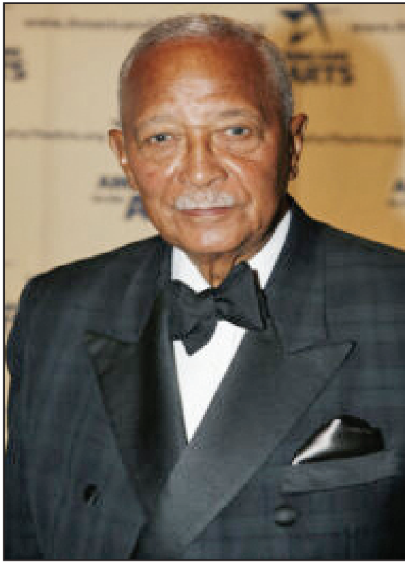
David N. Dinkins 1927 — 2020

His administration initiated the revitalization of Times Square and secured an unprecedented deal to keep the U.S. Open Tennis Championships in New York for the next 99 years. This arrangement generates more annual financial benefits to the city than the Yankees, Mets, Knicks, and Rangers combined.