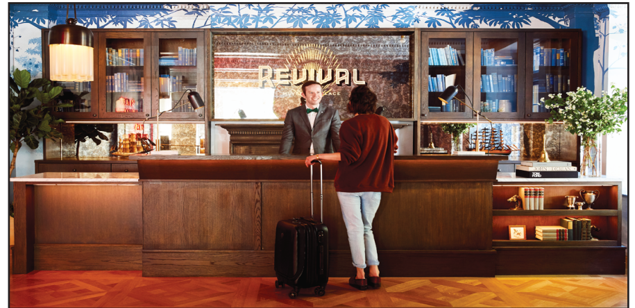
The Urban Oyster is now operating from Hotel Revival.

they are cooked with things they are familiar with such as garlic and butter.”