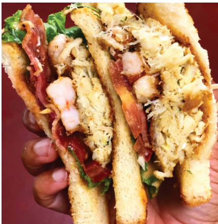
The Urban Oyster’s Hook, Line & Sinker Sandwich. Created by Norton’s father, the sandwich is comprised of fried cod, shrimp and oysters with lettuce, tomato, bacon, and special sauce.

restaurant’s unique way of serving them has “opened up” their willingness to try them.