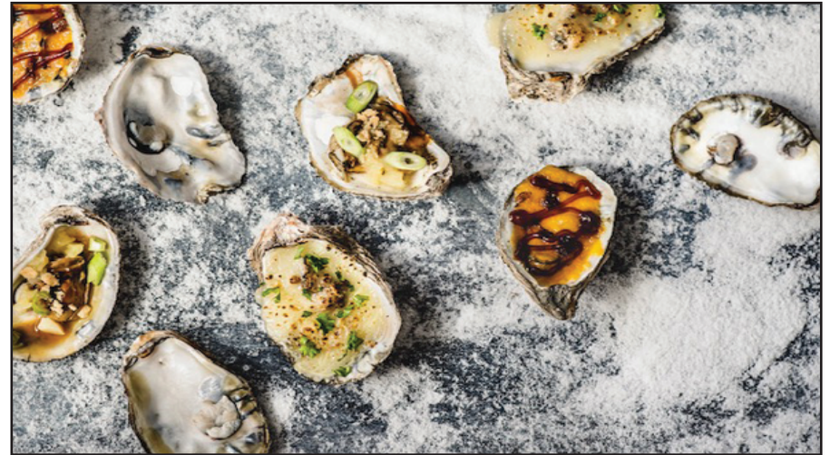
The Urban Oyster’s famous chargrilled oysters include Cheese Louise, Teriyaki, and Volcano Oy.

“Charbroiled oysters addressed their concerns about them being slimy. People are more willing to try them because