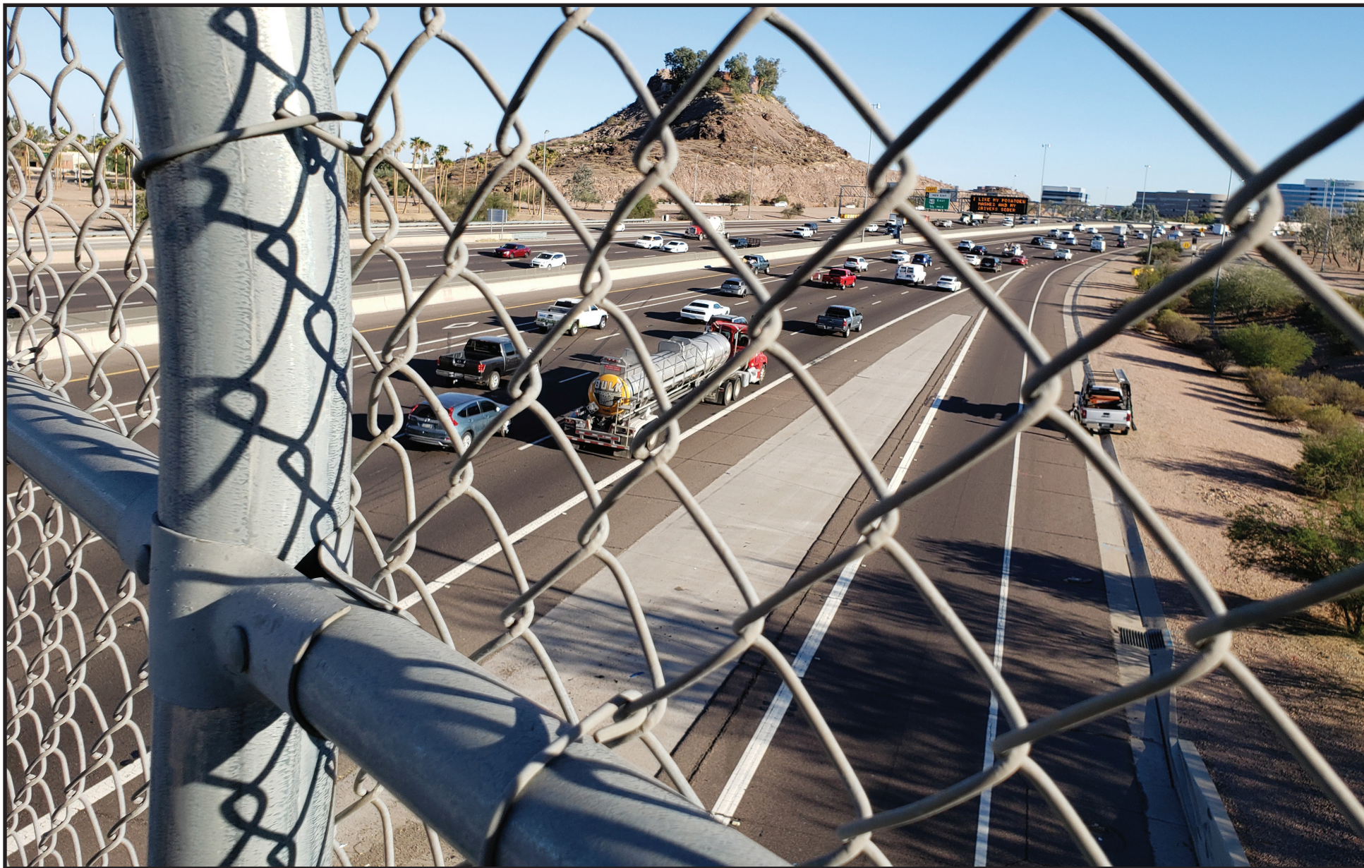
TRAFFIC ON THE BROADWAY CURVE has been a nightmare for years. ADOT is about to fix that.