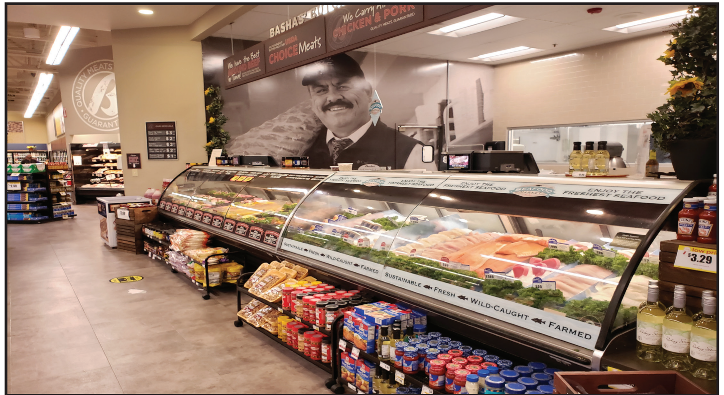
A Tempe woman was a victim of theft twice at a Bashas' near Warner and McClintock, with the more recent crime occurring near the butcher block in the South Tempe store.

The scam was thwarted but the call begs the question: How many Tempe and West Chandler residents will fall victim to robbery, theft and fraud this holiday season?