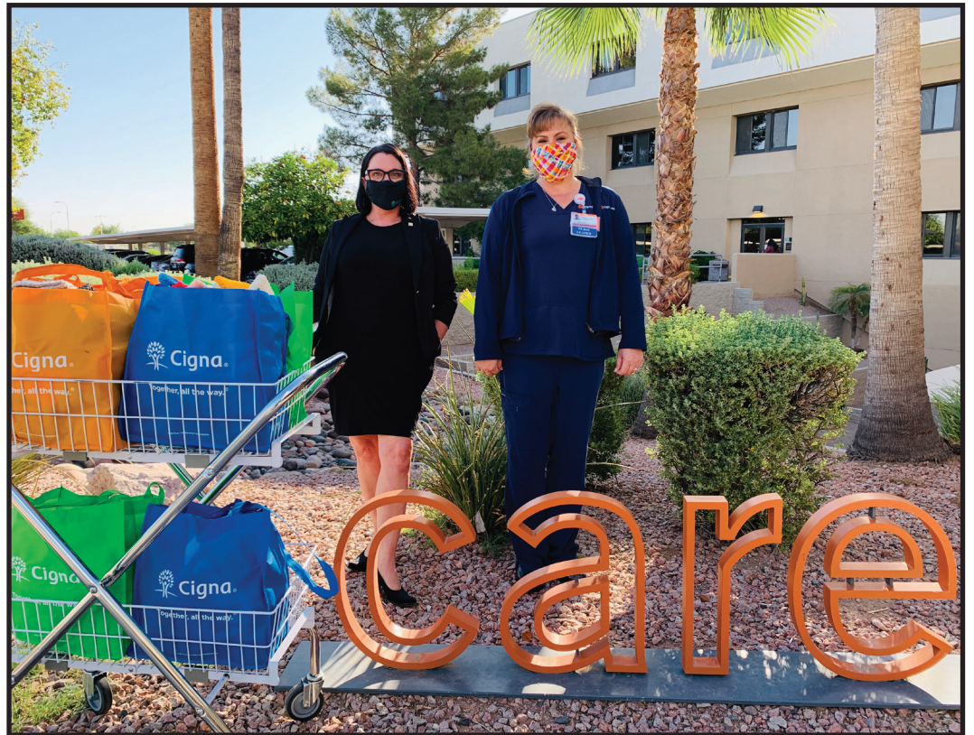
Volunteers from A Common Thread hand-crafted 300 caps for tiny infants in the Neonatal Intensive Care Unit and continuing care nursery at Dignity Health Chandler Regional Medical Center.

It's nice to reduce a bit of their worry. "It's a special outreach and comfort to these parents that people right in their community are thinking of them in a year that's been stressful all around," she said.