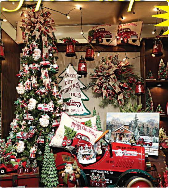
One Stop For All Your Holiday Decorating & Gift Giving!

Let us help decorate your home with our large selection of Holiday decor & accents. Come browse through our varied selection.