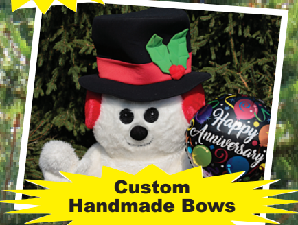
Custom Handmade Bows