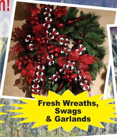
Fresh Wreaths, Swags & Garlands

Call 570.366.2619 or order online 24/7 at: www.OrwigsburgFlorist.com