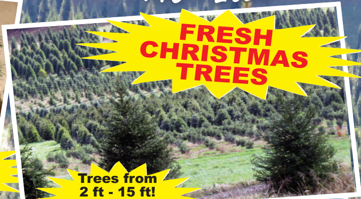
FRESH CHRISTMAS TREES