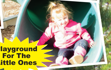
Playground For The Little Ones