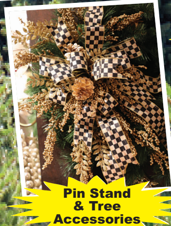
Pin Stand & Tree Accessories

Let us help decorate your home with our large selection of Holiday decor & accents. Come browse through our varied selection.