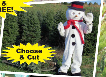
Choose & Cut