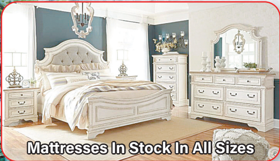
Mattresses In Stock In All Sizes

We have the last minute gift ideas that will blow them away!