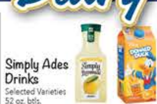
Simply Ades Drinks Selected Varieties 52 oz. btls. Donald Duck Orange Juice Selected Varieties From Concentrate 59 oz. ctns.