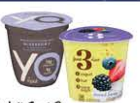
Yoplait Just 3 Or YQ Yogurt 5-5.3 oz. cups