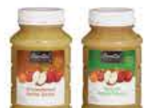
Essential Everyday Applesauce Selected Varieties 23-24 oz. jars