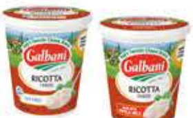
Galbani Ricotta Cheese Part Skim Or Whole Milk 15 oz. ctns.