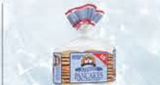
De Walfelbaker's Pancakes Blueberry Or Buttermilk 18 ct. pkg.