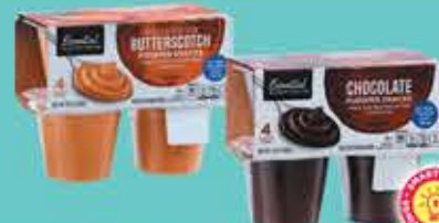
Essential Everyday Pudding Selected Varieties 4 pk. 3.5 oz. cups