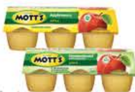
Mott's Applesauce Selected Varieties 6 ct. 3.9-4 oz. cups