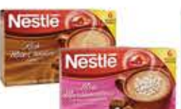
Nestle Hot Cocoa Mix Milk Chocolates Or With Mini Marshmallows 6 ct. box