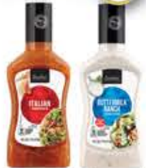
Essential Everyday Salad Dressing Selected Varieties - 16 oz. btls.