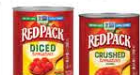
RedPack Tomatoes Selected Varieties 28-29 oz. cans