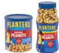
Planters Peanuts Selected Varieties 16-20 oz. ctns.