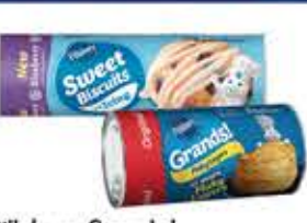
Pillsbury Grands! Or Sweet Biscuits Selected Varieties 12.4-16.3 oz. cans