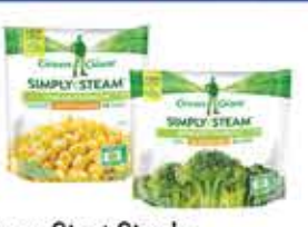
Green Giant Simply Steam Vegetables Selected Varieties 9-10 oz. pkgs.