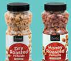
Essential Everyday Dry Roasted Peanuts Selected Varieties - 16 oz. jars