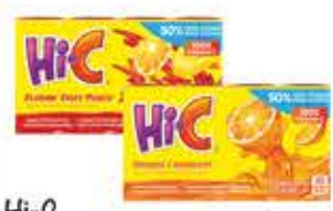
Hi-C Fruit Drinks Selected Varieties 8 pk. 6 oz. boxes