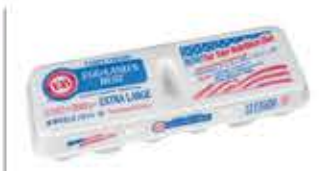
Egg-Land's Best Extra Large Eggs Grade A dozen