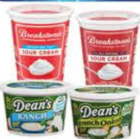
Breakstone's Sour Cream Selected Varieties - 16 oz. ctn. Dean's Dips French Onion Or Ranch 16 oz. ctn.