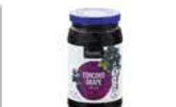
Essential Everyday Concord Grape Jelly 18 oz. jar