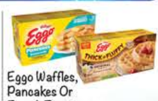
Eggo Waffles, Pancakes Or French Toaster Sticks Selected Varieties 11.6-16.4 oz. boxes