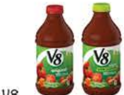
V8 Vegetable Juice Selected Varieties 46 oz. btls.