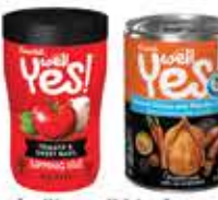
Campbell's well Yes! Or Sipping Soups Selected Varieties 11-16.3 oz. cans