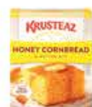
Krusteaz Honey Cornbread & Muffin Mix 15 oz. boxes