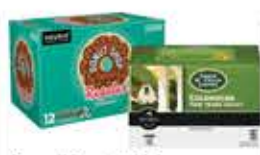
Green Mountain Or Donut Shoppe K-Cups Coffee Selected Varieties 10-12 ct. box