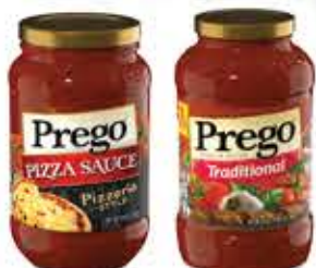
Prego Pasta Or Pizza Sauce Selected Varieties 14-24 oz. jars