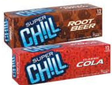
Super Chill Soda Selected Varieties 12 pk. 12 oz. cans