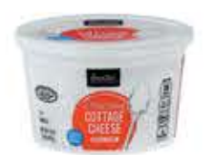
Essential Everyday Cottage Cheese 4% Milk Fat, Small Curd 16 oz. ctn.