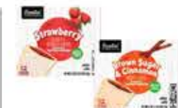
Essential Everyday Toaster Pastries Brown Sugar Or Strawberry 22 oz. boxes