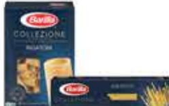
Barilla Collezione Pasta Spaghetti, Rigatoni Or Penne 12-16 oz. boxes