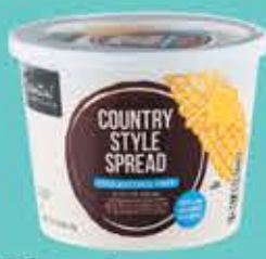
Essential Everyday Country Style Spread 45 oz. tubs