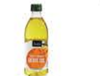
Essential Everyday Olive Oil Extra Virgin, Light Or Pure 17 oz. btl.