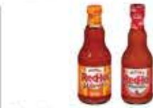
Frank's BBQ, RedHot Or Wing Sauce Selected Varieties 12-14 oz. btl.