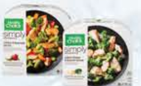
Healthy Choice Simply Cafe Steamers Selected Varieties 9-10 oz. pkgs.