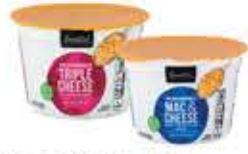
Essential Everyday Mac & Cheese Cups Original Or Triple Cheese 2.95 oz. cup