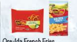
Ore-Ida French Fries, Potatoes Or Onion Rings Selected Varieties 16-32 oz. pkgs.