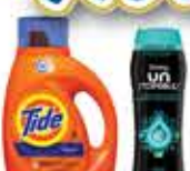
Tide Laundry Detergent Selected Varieties - 46 oz. btl. Downy UN STOPABLES Scent Booster Selected Varieties - 8.6 oz. btl.