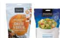
Essential Everyday Croutons Selected Varieties 5 oz. pouch