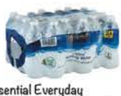
Essential Everyday Natural Spring Water 24 pk. 16.9 oz. btls.