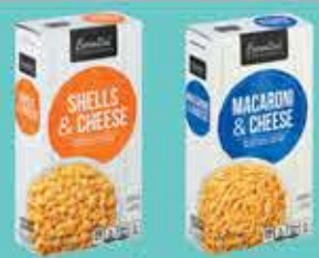
Essential Everyday Macaroni & Cheese Selected Varieties - 5.5-7.25 oz. boxes