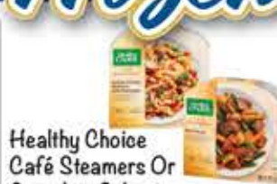
Healthy Choice Cafe Steamers Or Complete Selection Dinners Selected Varieties 9.25-12 oz. pkgs.