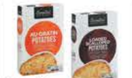
Essential Everyday Potatoes Selected Varieties 4.5-4.7 oz. box