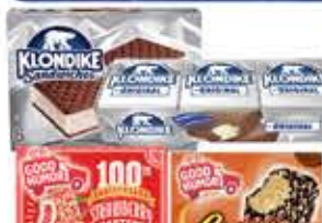
Klondike Ice Cream Bars Or Sandwiches Selected Varieties - 4-12 ct. pkgs. Good Humor Ice Cream Novelties Selected Varieties - 6 ct. boxes