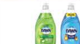
Dawn Ultra Dish Detergent Selected Varieties 16-19.4 oz. btl.