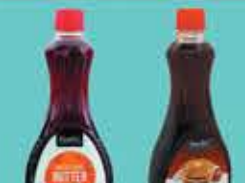
Essential Everyday Pancake Syrup Selected Varieties - 24 oz. btl.