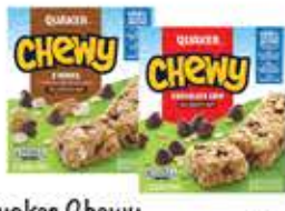
Quaker Chewy Granola Bars Selected Varieties 6.1-7.4 oz. boxes