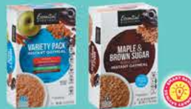
Essential Everyday Instant Oatmeal Selected Varieties - 11.8-15.1 oz. box.