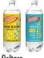
Vintage Seltzer Or Tonic Water Selected Varieties 33.8 oz. btls.