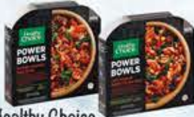
Healthy Choice Power Bowls Entrees Selected Varieties 9-9.75 oz. pkgs.