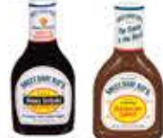
Sweet Baby Ray's Barbecue Sauce Or Sauce & Marinade Selected Varieties 14-18 oz. btls.