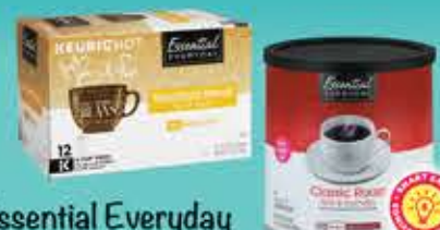
Essential Everyday Coffee K-Cups Or Ground Coffee Selected Varieties 12 ct. box Or 24.2-30.5 oz. can

LIMITED TIME ONLY! STOCK UP ON YOUR FAVORITE BRANDS