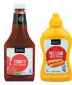
Essential Everyday Tomato Ketchup Or Yellow Mustard 14-24 oz. btls.