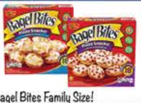
Bagel Bites Family Size! Pizza Snacks! Three Cheese Or Cheese & Pepperoni 14 oz. box