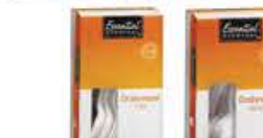
Essential Everyday Dinnerware Cutlery Variety Pack, Spoons Or Forks 48 ct. boxes