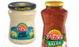
Pace Sauce, Salsa Or Picante Sauce Selected Varieties 15-16 oz. jars