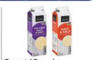
Essential Everyday Half & Half Regular Or Fat Free 32 oz. ctns.