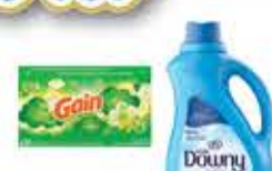
Downy Fabric Softener Selected Varieties - 51 oz. btl. Gain Fabric Softener Sheets Selected Varieties - 120 ct. box