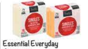
Essential Everyday American Cheese Singles Individually Wrapped Yellow Or White - 16 Slices 12 oz. pkg.