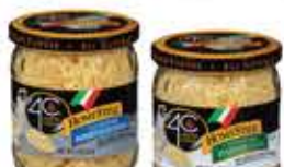
4C Parmesan Cheese Selected Varieties 6 oz. jar