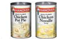
Hanover Ready-To-Serve Soup Selected Varieties 18.8-19 oz. cans