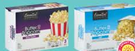
Essential Everyday Microwave Popcorn Selected Varieties 3 ct. 8.1-8.7 oz. boxes