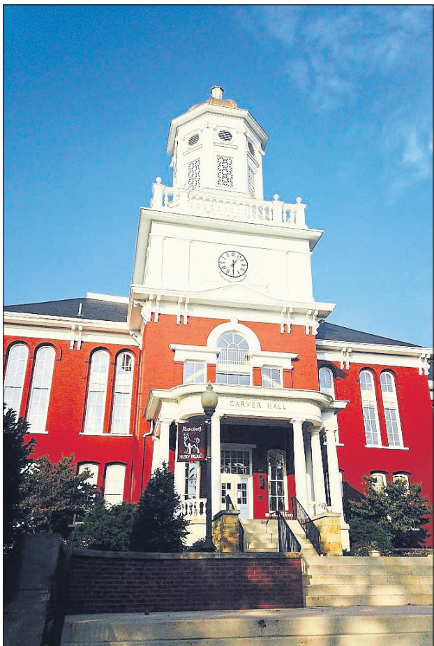
Carver Hall at Bloomsburg University.

challenging times. You've had to adapt to new ways of learning in high school and your search for the perfect-fit college has been greatly impacted. But Huskies are never afraid of the path ahead, and face every challenge as a new way onward. If you've got a forward focus and the spirit to back it up, you're ready to experience the Husky difference. Visit admissions.bloomu.edu to learn more, tour our beautiful campus, request information or start your application today. BU is SAT/ACT test optional this year, so you can begin your climb even faster. Your onward and upward await at Bloomsburg University!