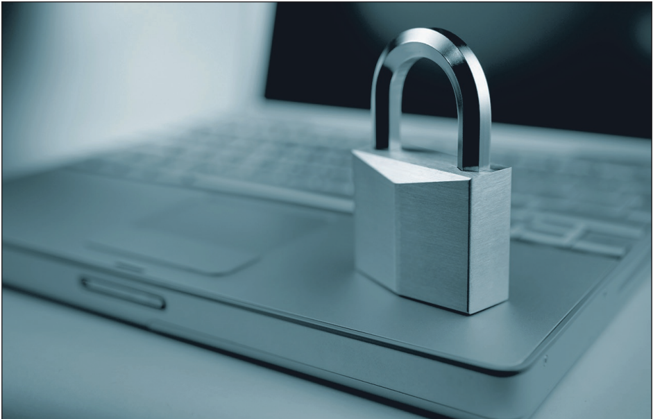
METRO CREATIVE CONTENT

JOIN THE PTA OR A SIMILAR SCHOOL-SANCTIONED ORGANIZATION » Many groups perform functions that facilitate strong connections between home and school. Joining and working with such organizations can improve the school experience for everyone. BUY BOX TOPS-AFFILIATED PRODUCTS » The Box Tops for Education program donates 10 cents per box top label collected and submitted by schools back to that school. More than 80,000 elementary schools have earned money through the program to buy equipment and supplies. Box Tops can be found on many different food packages. TREAT THE TEACHER » In addition to supporting Teacher Appreciation Days and other school events, send in an uplifting note, snack or another way of showing you appreciate his or her efforts.