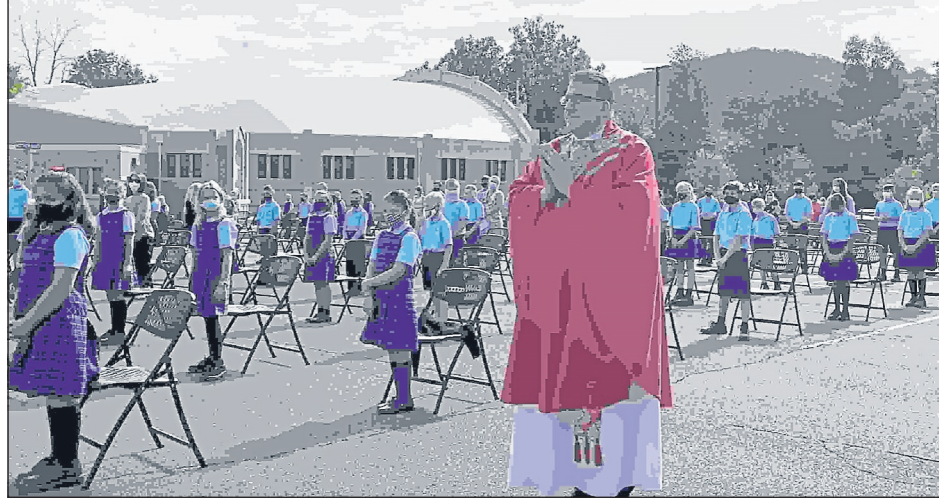
Above: St. Mary Catholic School fifth-graders perform "Silent Night" with sign language. At left: St. Mary Catholic School Celebrates the Opening School Mass outdoors.

dents achieve this distinguished honor and have been awarded $429,000 in Neumann Scholarships. This year our students have received $99,000 in scholarship money and counting!