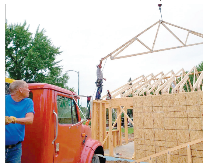
A new Habitat for Humanity home at 218 Minnesota Avenue South in Aitkin.