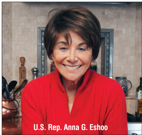
U.S. Rep. Anna G. Eshoo