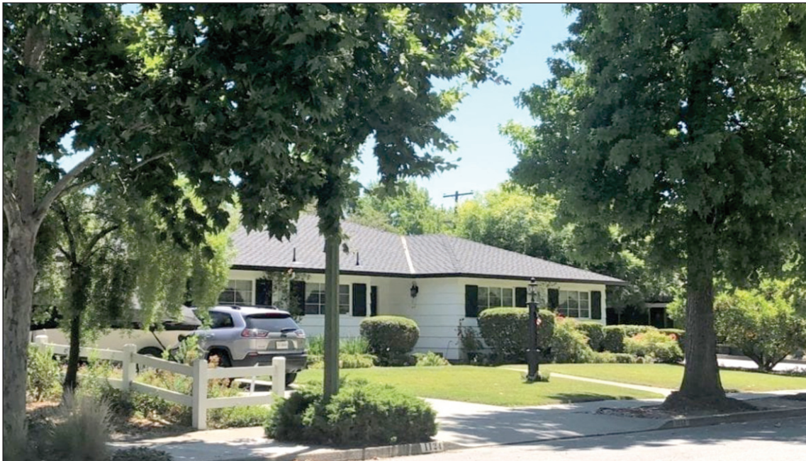
A single-family home in the Willow Glen neighborhood of San Jose.

SERVING WILLOW GLEN, SAN JOSE ■ WWW.WILLOWGLENTIMES.COM