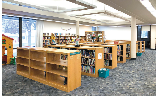
The children's area was completely redone due to water damage. Improvement now includes new carpet throughout and a new skylight over the circulation desk.

Phone (218) 546-8005 librarian@hallettlibrary.org