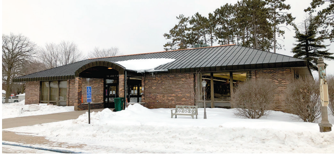
Jessie F. Hallett Memorial Library exterior with new roof.