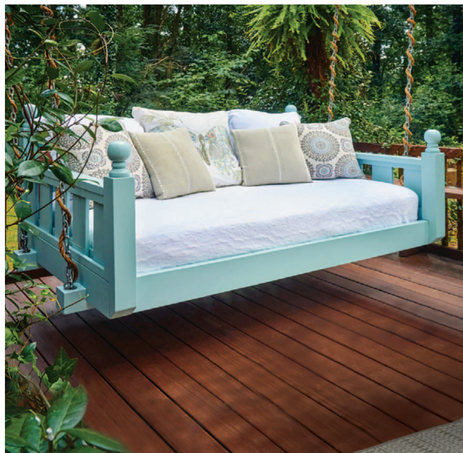
Build this comfy Swing Bed using a downloadable plan, tools and supplies from Woodcraft.

Saw wood to size with the Festool CARVEX PS 420 EBQ-PLUS Jig-saw that can cut up to 43/4" wood beams, as well as aluminum and steel. The Razorsaw Ryobi handsaw from Gyokucho, also a powerful cutting tool, has ripping and crosscutting teeth on opposite sides and an adjustable pivot point for angled cutting in tight spaces.