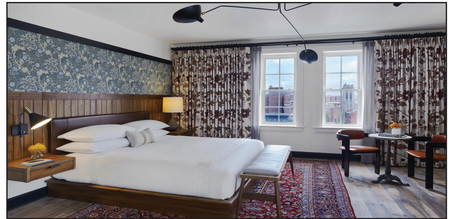
One of the guestrooms located in Hotel Revival, a Joie de Vivre hotel located in the heart of Baltimore's historic Mount Vernon neighborhood, and a part of "A Great Time for Two."