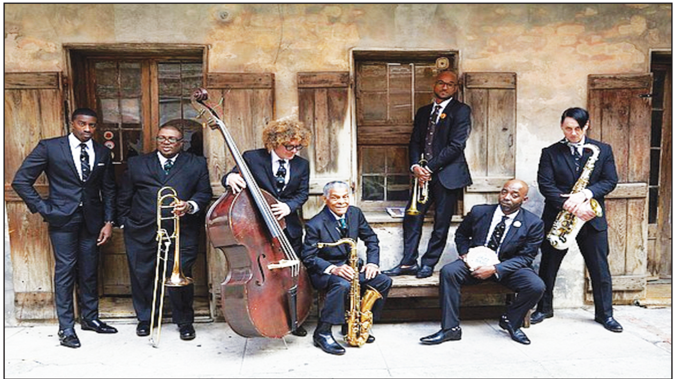
In 2019, The Baltimore Symphony Orchestra presented the New Orleans-based Preservation Hall Jazz Band as part of its “SuperPops” series at the Joseph Meyerhoff Symphony Hall in Baltimore.

“We cannot do this alone and have begun to engage leaders who can help us pursue this critical work authentically and thoughtfully. We have held facilitated DEI-focused sessions for BSO stakeholders, including Board of Directors, musicians, and management, with more strategic facilitation to