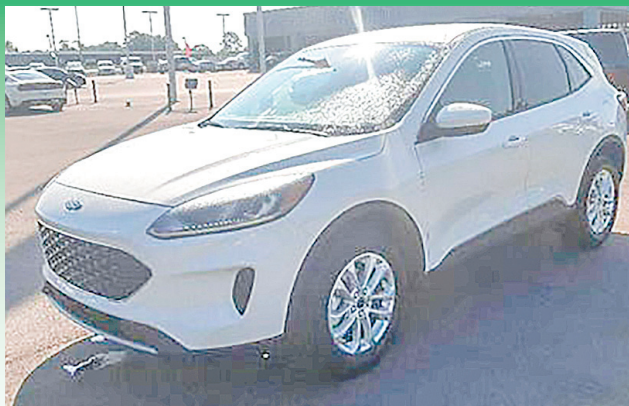
2020 Ford Escape SE