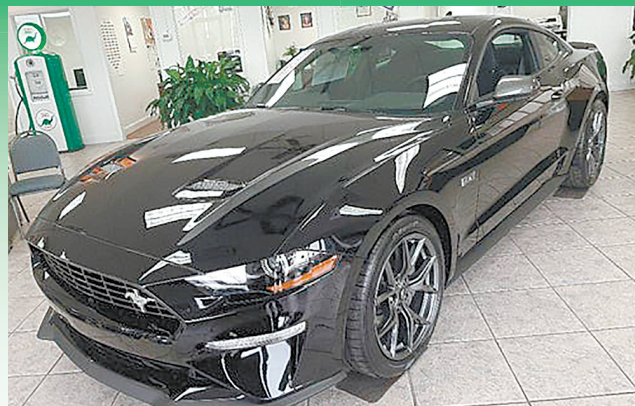
2020 Ford Mustang EcoBoost