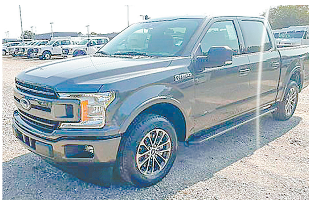
2020 Ford F-150 XLT