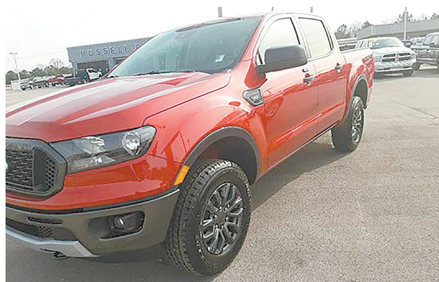
2020 Ford Ranger XLT