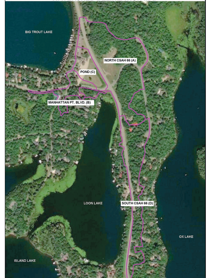
WATERSHED DELINEATION MAP

Funds for this project provided in part by the Board of Water and Soils Recourses through the Clean Water and Land Legacy Amendment.