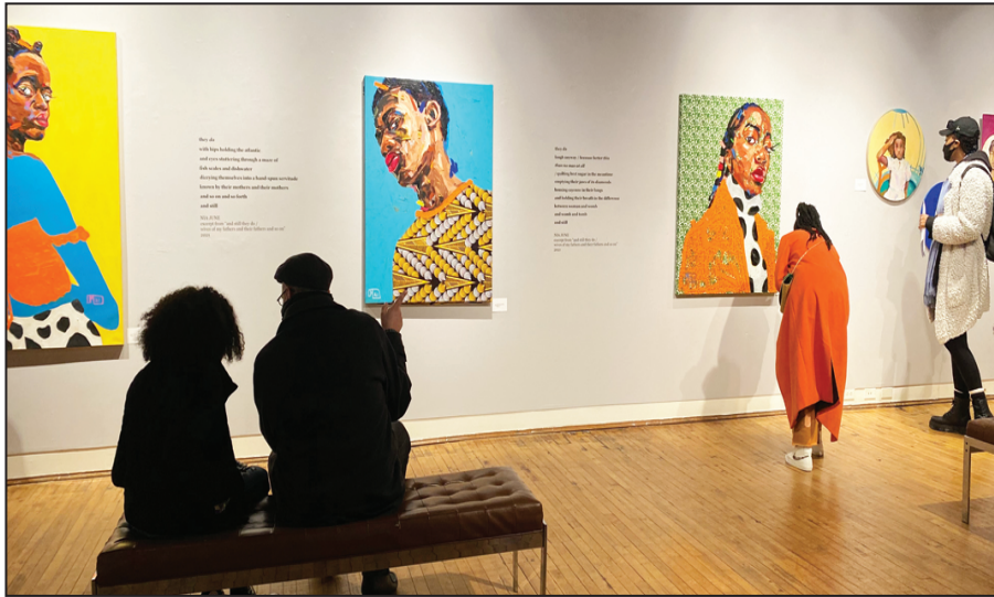
Visitors browsing we make do // wit wat we got