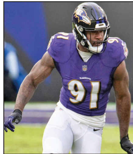
The Ravens sent a 2021 third-round pick and a 2022 conditional fifth-round pick to the Vikings for Yannick Ngakoue (pictured) in October last year.