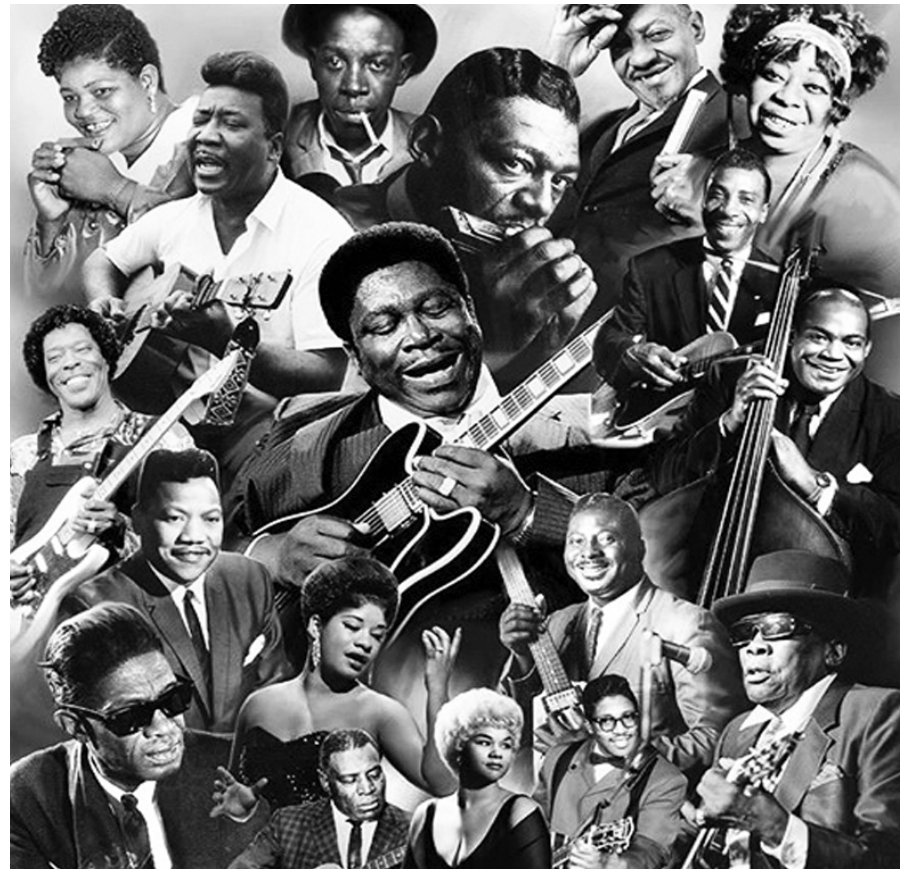
Baltimore Blues Society celebrates 35 years this month. It was in 1986 that die-hard blues fans in the Baltimore Region decided to join together and create one of the early blues societies in the country. Help them celebrate.