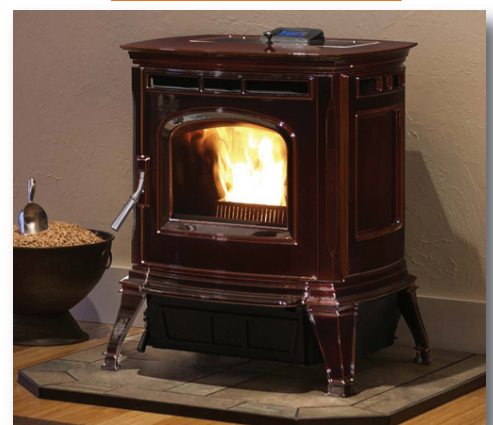
Harman Absolute 43 Pellet Stove

Stop By Our Showrooms To See All Our Stoves.