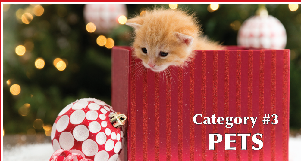
Category #3 PETS