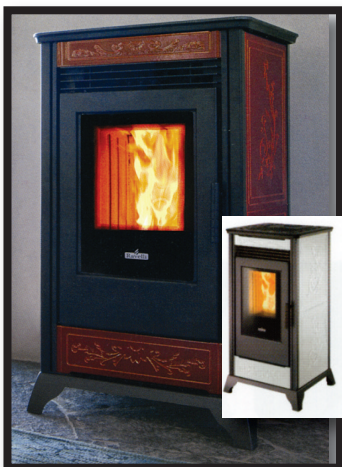
RV 80 Ceramic BTU 8,500 UP TO 35,000