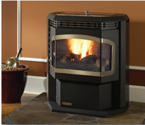
Quadra-Fire Classic Bay 1200 Pellet Stove