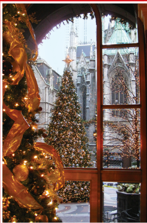
Category #2 SCENERY