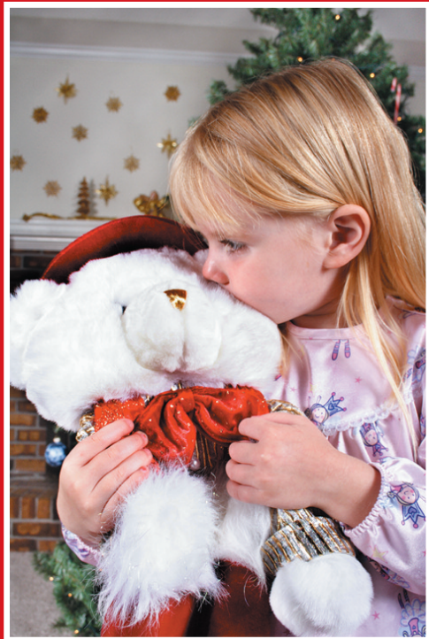
Category #1 CHILDREN