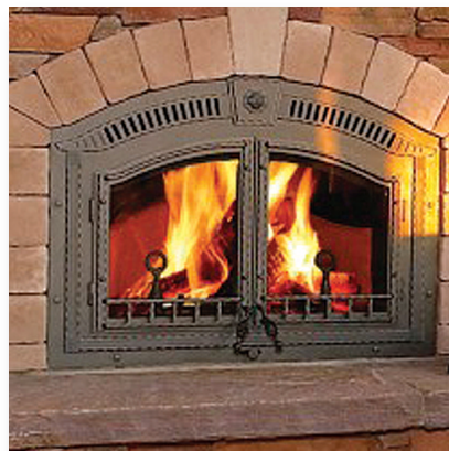
Napoleon® NZ6000 Wood Burning Fireplace