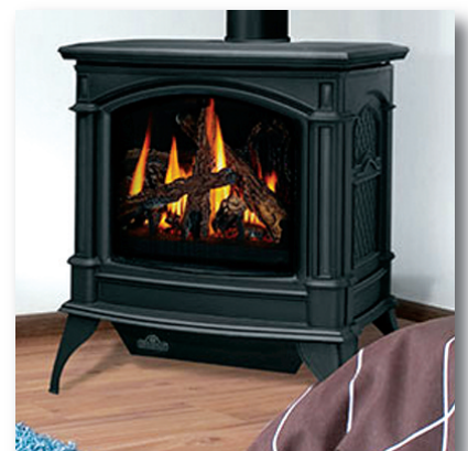
Napoleon® GDS60 Gas or Propane Stove UP TO 35,000 BTUs