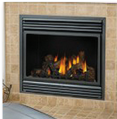
Napoleon® BGD36 Gas Fireplace