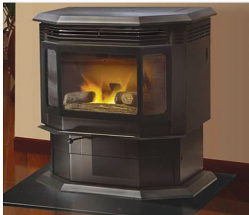
Harman Advance Pellet Stove