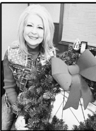
Replica of the wreath with bow, which is placed in cemeteries across US.