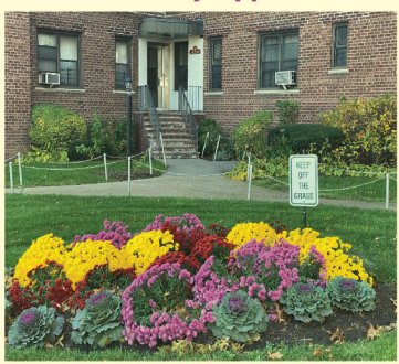
CORONA QUEENS 1 BEDROOM, 1 BATH CO-OP, IDEAL LOCATION NEAR ALL, INCLUDING LAGUARDIA AIRPORT AND CITIFIED. $132.500