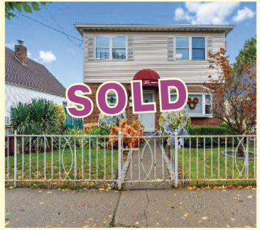
THROGGS NECK 1 FAMILY STUNNING HOME $725,000