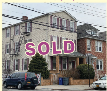
PELHAM BAY 3 FAMILY MINT HOME $1,140,000