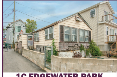
1C EDGEWATER PARK S139.000 W/SHARES INCLUDED