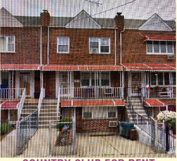
COUNTRY CLUB FOR RENT 3 BEDROOMS, 1 ½ BATHS DUPLEX FRONT AND REAR PORCHES. $2,700