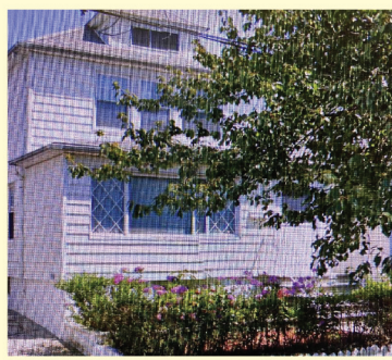
PELHAM BAY MOVE-IN-READY 2 FAMILY BEING USED AS A 1 FAMILY, 3 OVER 3 WITH SUN PORCH OVER BASEMENT, DETACHED GARAGE. $619,000