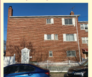
THROGGS NECK NEW LISTING LARGE 1 FAMILY HOME WITH FINISHED WALK-IN ON AN OPEN CORNER LOT. $698,000

Monday-Friday 9:00-6:00/Saturday 9:00-2:00|Off Hours Accommodated by Appointment