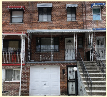
WAKEFIELD NEW LISTING FIXER-UPPER, 1 FAMILY, 1½ BATH, 3 BEDROOM DUPLEX WITH FAMILY ROOM GARAGE AND PRIVATE DRIVEWAY SOLD AS IS. $375,000