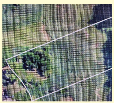
THROGGS NECK WATERFRONT LOTS SET AT THE END OF GLENNON PLACE BUILD YOUR OASIS ZONING PERMITS, 3-TWO FAMILIES OR 1-10 UNIT BUILDING WITH COMMUNITY FACILITY. $1,050,000