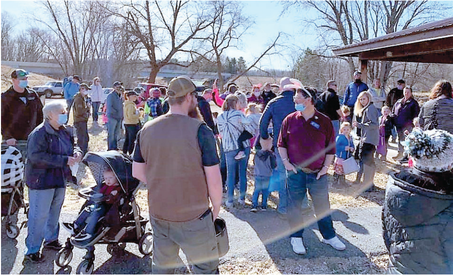
A crowd gathered in Palisade's Berglund Park on a sunny snowless day before Easter for an Easter Egg Hunt.

Do we think a few of those parents and grandparents sneaked a piece of chocolate during the festivities? I bet they did. 'Cuz Easter isn't Easter without eggs, bunnies, unpredictable weather, lots of food, and of course, best of all, chocolate.