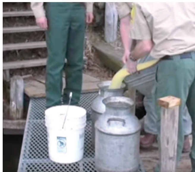
The collected walleye eggs are transported in milk cans that have been in use since the 1920s.