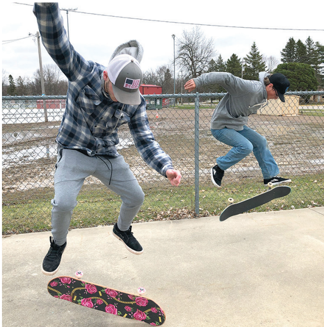
Local skateboarders demonstrate their skills at the the Aitkin City Park.