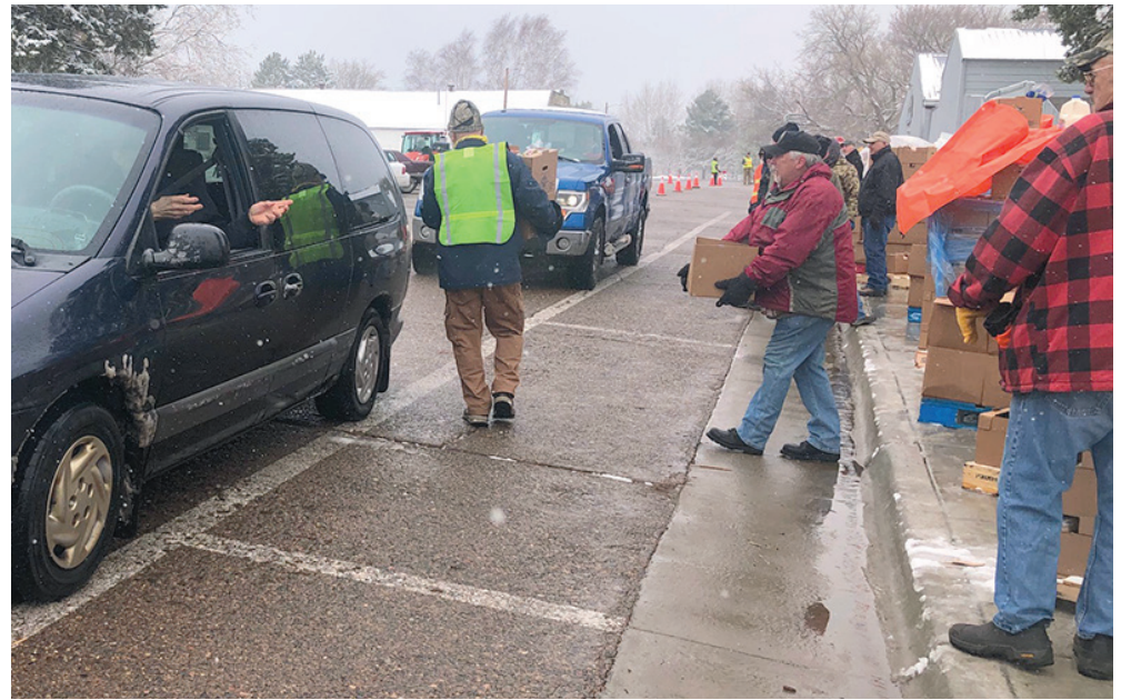
Helping Hands volunteers distribute boxes of food undeterred by spring snow showers on Tuesday, April 13.