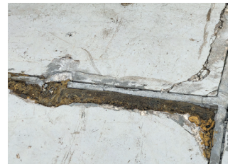
Cracks such as this have developed at the Aitkin Skate Park and need repairs.