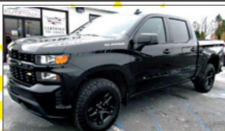
2019 Chevy Silverado Custom Crew U5821, 28L Miles