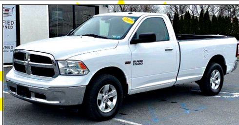
2017 Dodge Ram 1500 U55840, 8' Bed, SLT, 4x4