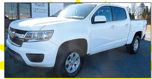
2018 Chevy Colorado 4x4 U5812, Low Miles