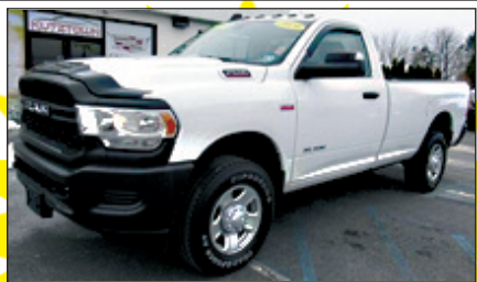
2019 Dodge Ram 2500 U5818, 8' Bed

3 LOCATIONS: Fleetwood Morgantown Preowned Superstore Rt. 222