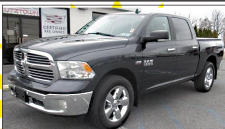
2017 Dodge Ram Bighorn Crew U5829, Only 17K Miles