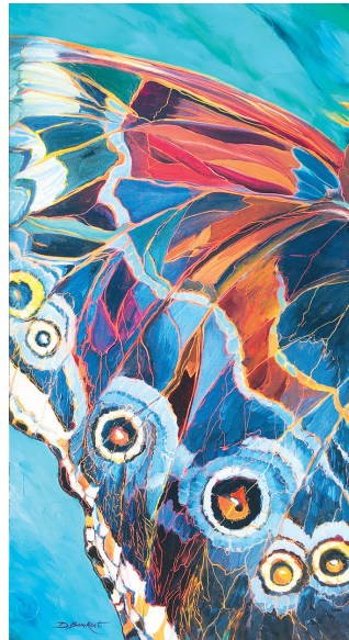
"Wingspace" by Denise Bunkert, 24"x48", oil on canvas.

For the new show at Ripple River Gallery, 15 artists responded to the theme "Emergence/Re-emergence." The result is a wide-range of viewpoints, expressions and media—work ranging from felted wool to clay to photography and painting—and an exhibit that is at once