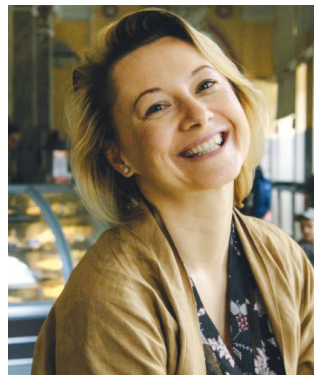
Central Lakes College' Verse Like Water program is host-

ing poet Valzhyna Mort for a free virtual reading at noon on Tuesday, April 27. The link for viewing is: www.youtube.com/watch?v=BO1Uy8pbqEU .