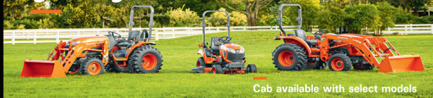
Cab available with select models