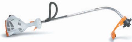
FS 38 C-E TRIMMER