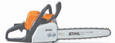
MS 170 CHAIN SAW