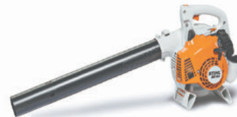
BG 50 HANDHELD BLOWER