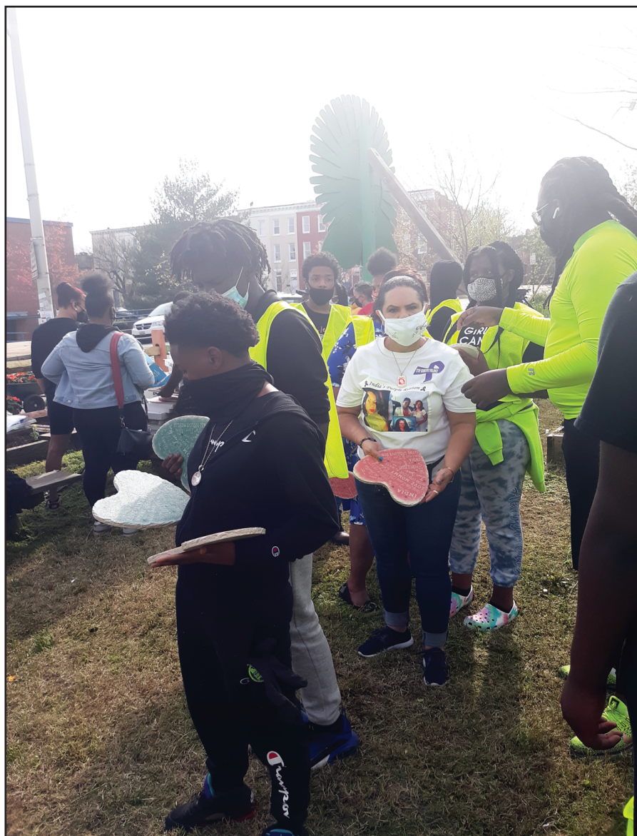
Let's Thrive Baltimore youth and families honor victims of gun violence with their names inscribed on stones to be placed around the border of Healing City Garden.

The project was made possible by funding from Philanthropy Tank, a local nonprofit that aims to empower youth by challenging and equipping them to implement sustainable service-driven solutions to problems impacting their communities.