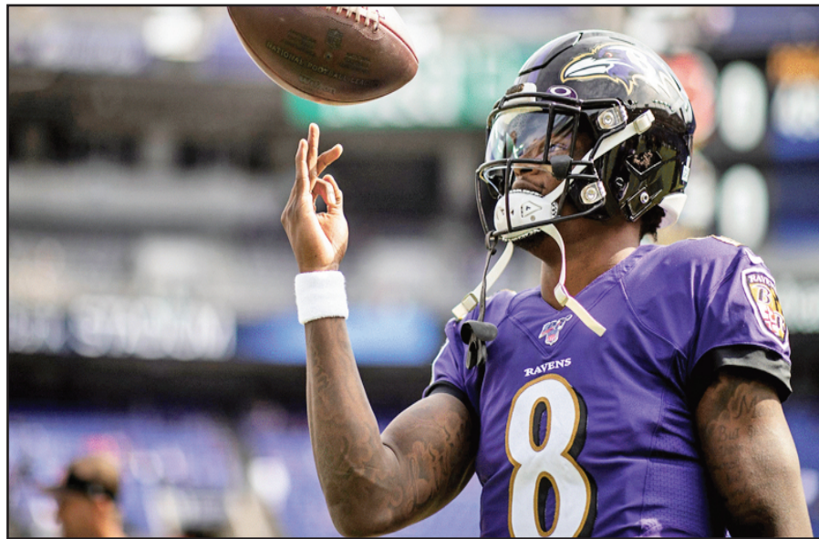
Baltimore Ravens quarterback Lamar Jackson is one of the NFL's top athletes. He was only 23 years old when he was named the NFL MVP after the 2019 season.