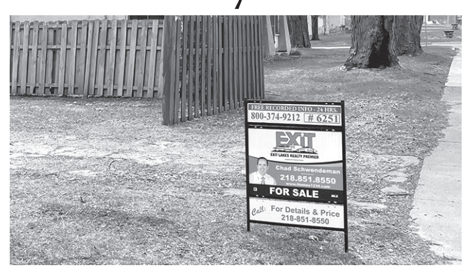
'For Sale' signs pop up in the area, but they don't last long. Property is snatched up quickly in this fast-growing sellers' market.

CWC property value assessment exceeds pre-2009 According to property assessment data released by Crow Wing County, total assessed value of all properties in