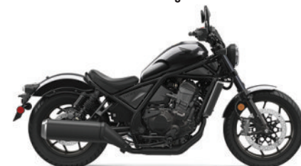
2021 Rebel 1100 DCT