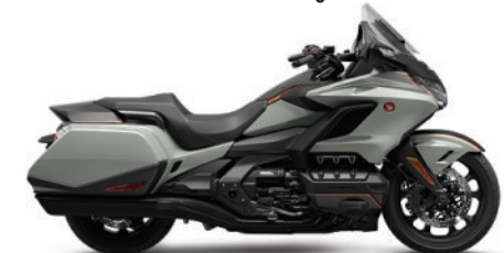
2021 Gold Wing Automatic DCT