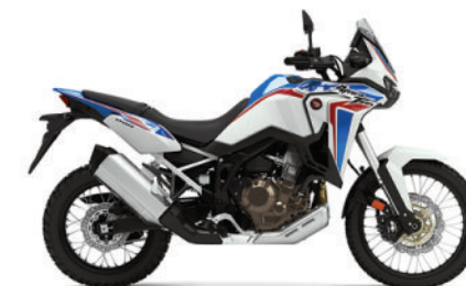
2021 Africa Twin DCT