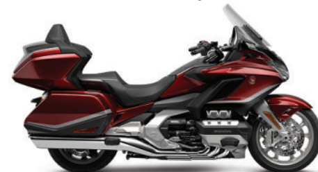
2021 Gold Wing ABS DCT