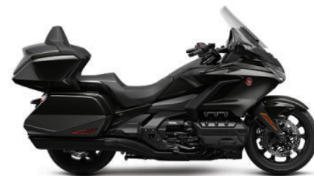
2021 Gold Wing Tour DCT