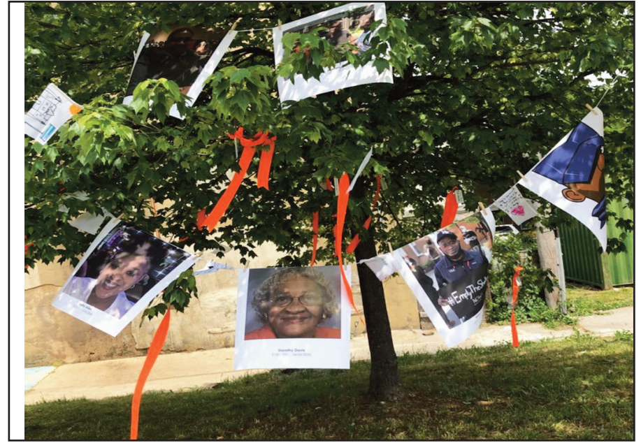
Photos and flags memorializing those who have lost their lives over the past year are displayed on trees outside of the Jubilee Arts office on Pennsylvania