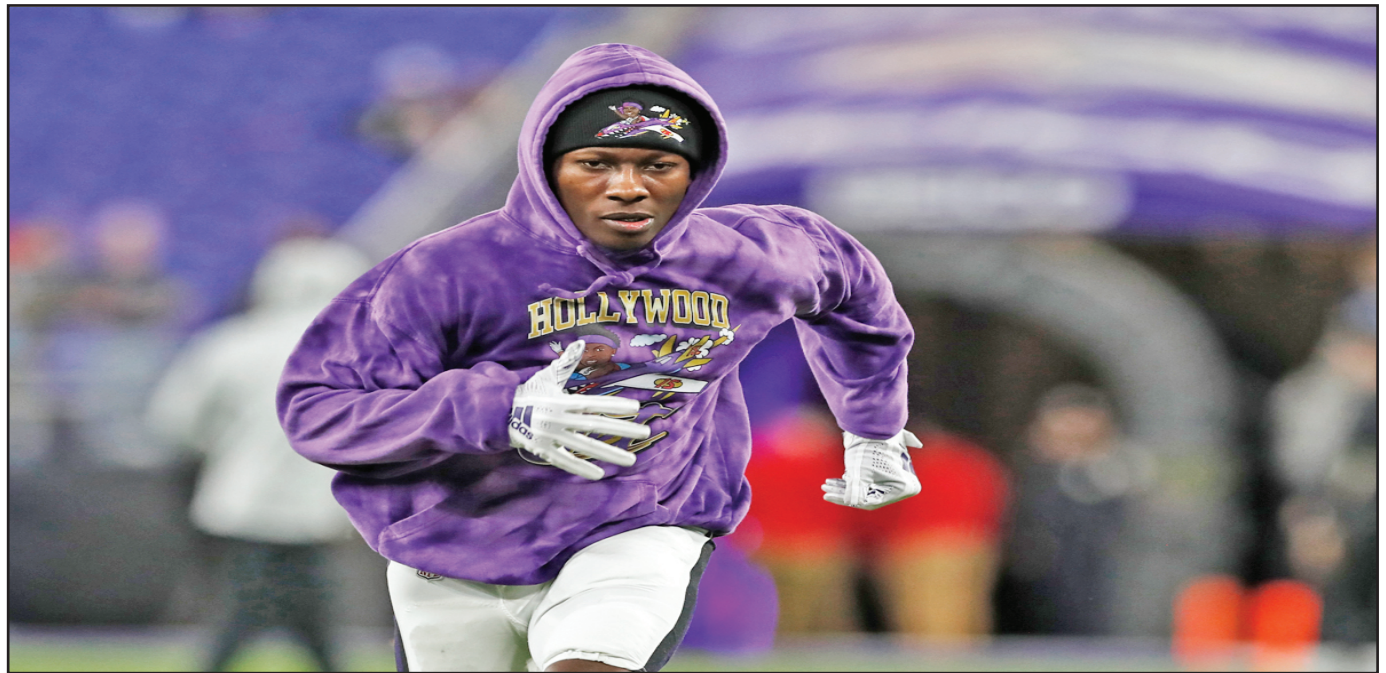
Baltimore Ravens wide receiver Marquise "Hollywood" Brown's new #5 jersey number takes him back to his days as a standout receiver at Oklahoma where he wore same number. He is taking steps to make a name for himself in the jersey after wearing #15 in each of his previous two seasons.