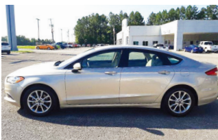
2017 Ford Fusion SE Stk#5022A, MSRP: $20,475 Your Price: $18,769