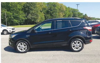
2017 Ford Escape SE Stk#8939P, MSRP: $19,700 Your Price: $17,075