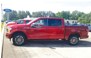
2018 Ford F-150 XLT SPORT Stk#9006P, MSRP: $49,375 Your Price: $47,557

Shop Online 24/7 - RussellBarnettFord.net & Complete the Whole Transaction Online!