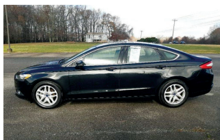
2015 Ford Fusion SE Stk# 5325A, MSRP: $18,525 Your Price: $16,995