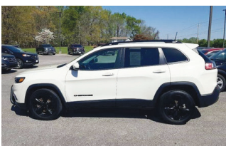
2019 Jeep Cherokee Altitude Stk#5592A, MSRP: $28,550 Your Price: $24,758