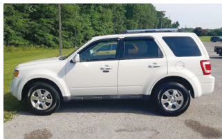
2011 Ford Escape Limited Stk#8965A, MSRP: $10,598 Your Price: $8,275