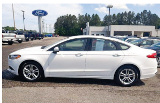
2018 Ford Fusion SE Stk#8994P, MSRP: $22,789 Your Price: $20,850