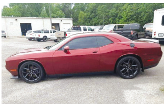
2019 Dodge Challenger GT Stk#8982P, MSRP: $38,600 Your Price: $31,798