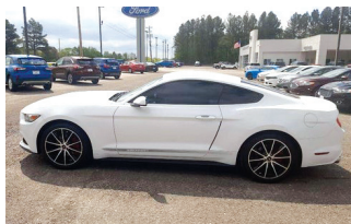
2017 Ford Mustang EcoBoost Stk#8966P, MSRP: $29,897 Your Price: $27,785