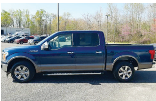
2018 Ford F-150 LARIAT Stk#5590A, MSRP: $50,000 Your Price: $44,635