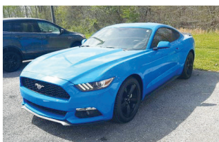
2017 Ford Mustang EcoBoost Stk#8962P, MSRP: $29,300 Your Price: $26,461