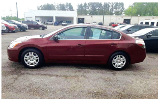
2012 Nissan Altima 2.5 S Stk#8778B, MSRP: $10,488 Your Price: $9,988