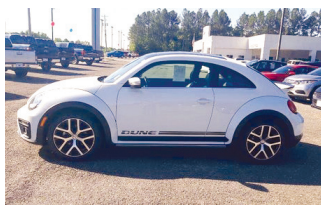
2018 Volkswagen Beetle Dune Stk#5414A, MSRP: $24,450 Your Price: $22,789