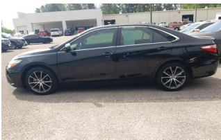
2015 Toyota Camry XSE Stk#5502B, MSRP: $15,978 Your Price: $13,257