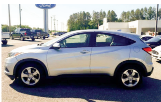
2019 Honda HR-V LX Stk#8952P, MSRP: $24,750 Your Price: $22,988