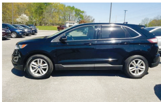
2016 Ford Edge SEL Stk#8851A, MSRP: $17,987 Your Price: $15,385